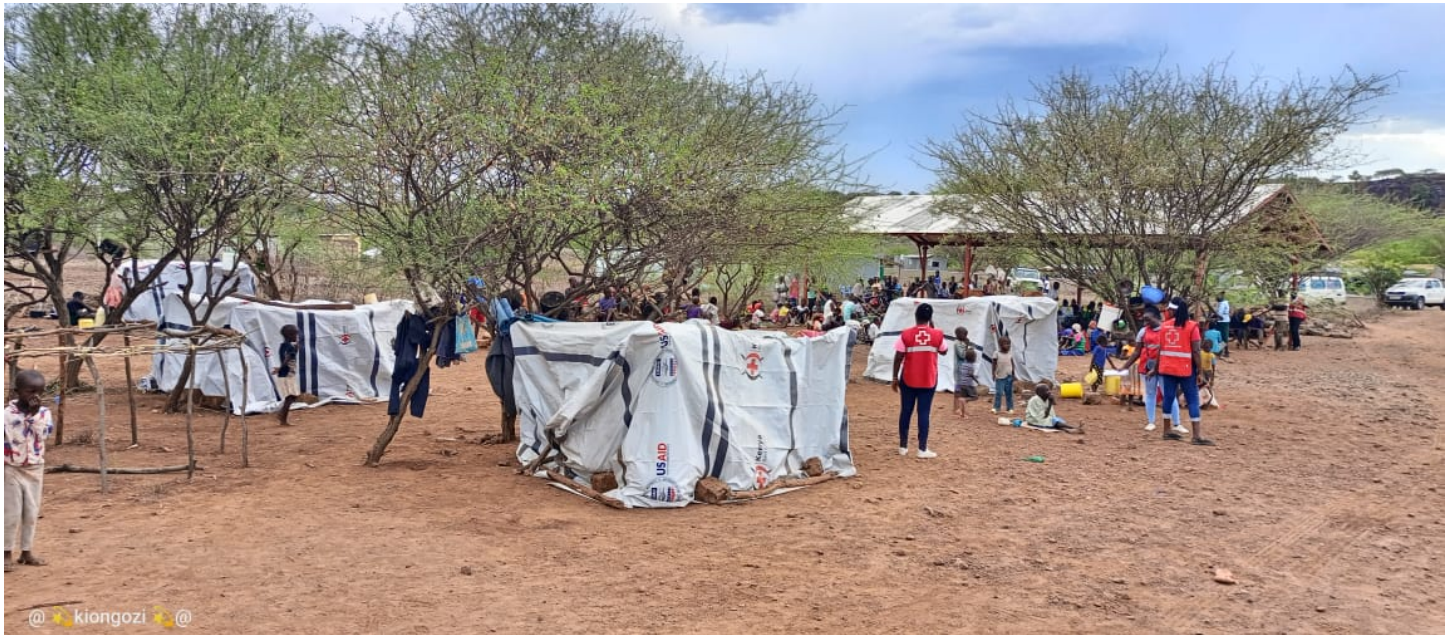
One of the Largest Camps in Mainomoi in Baringo County