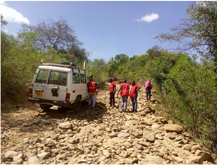
KRCS Conducts assessment in Tiaty East