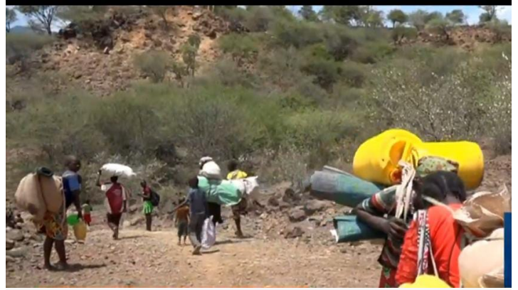
People Moving from their homes to Camps