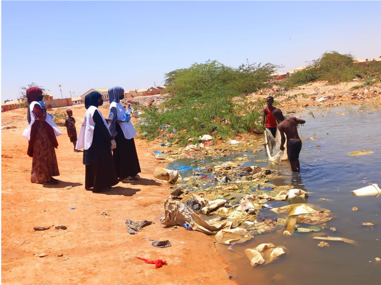
SRCS Volunteers providing awareness raising session to children from Jilab IDP camp playing in a waste water