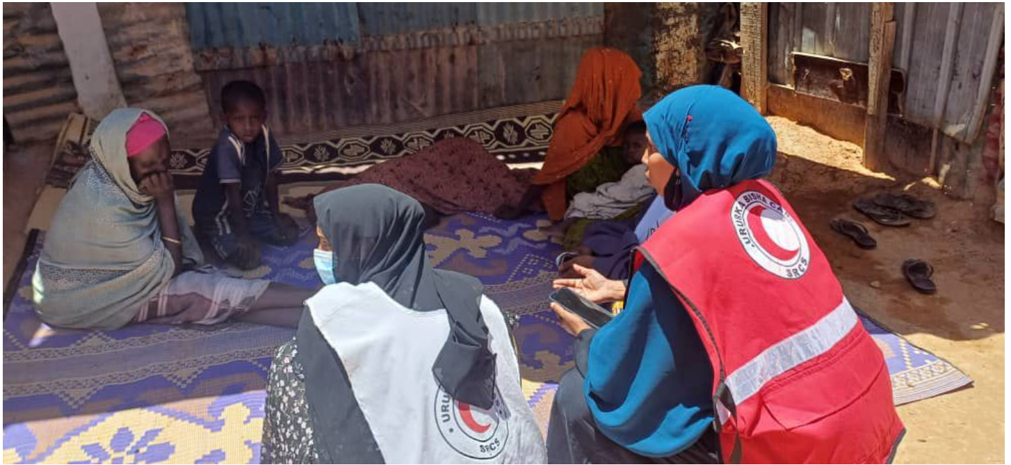
SRCS volunteers and staff observing the situation in the IDP community in Garowe

spillover of infections from some neighbouring countries. The upcoming Gu rains are expected to trigger outbreaks in areas where the disease has not been observed in years.