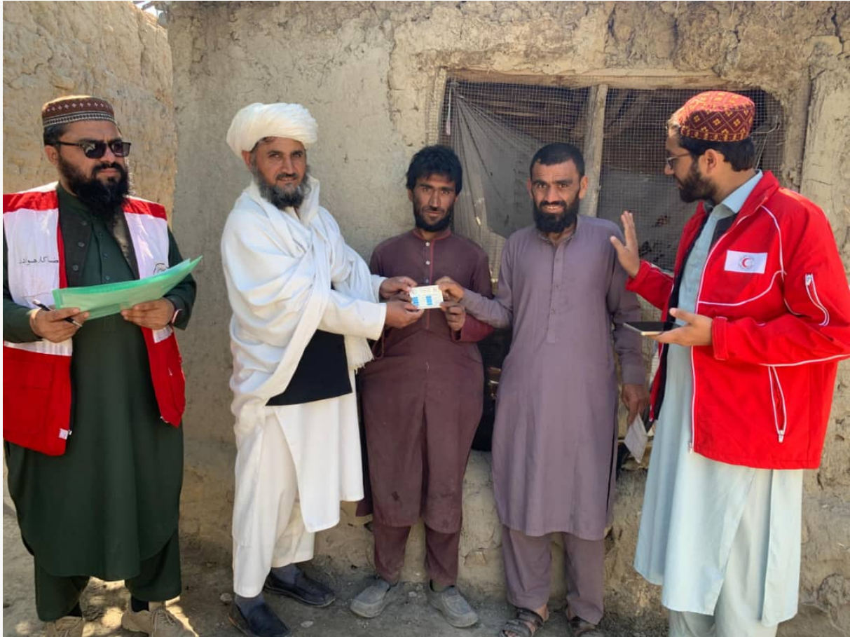
ARCS conducting beneficiary registration in Nangarhar Province