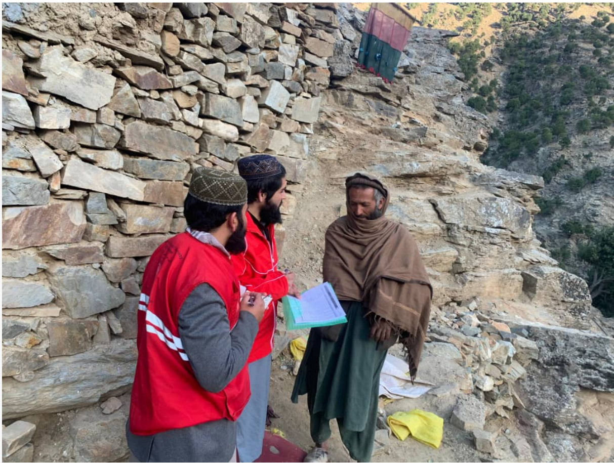
ARCS Volunteers carrying out selection and registration of beneficiaries in Nangarhar Province