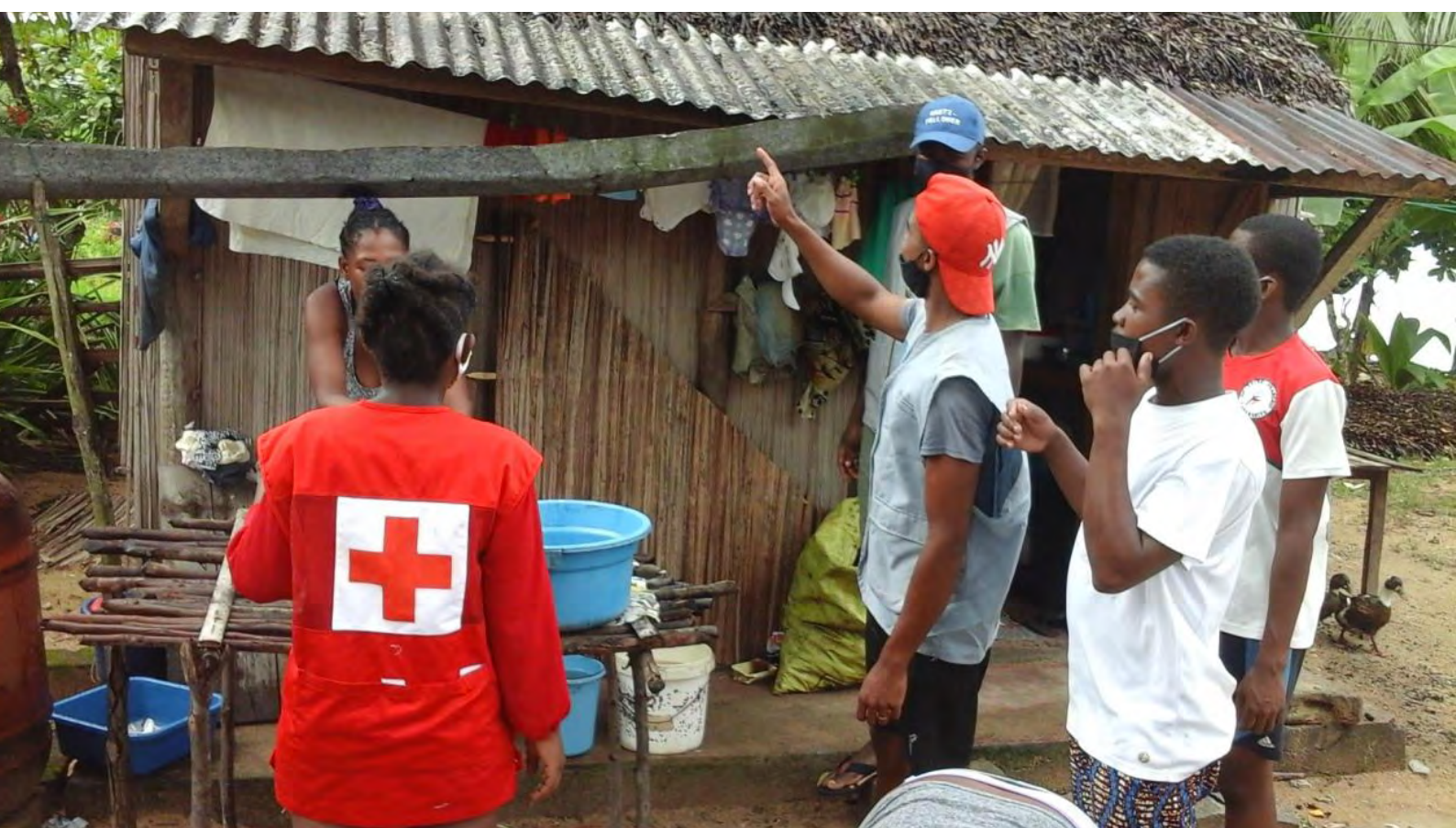
Malagasy Red Cross volunteers conducting a campaign to raise awareness and provide disaster preparedness training for community members, in January 2020

Crisis, the IFRC and ICRC coordinate action and support to National Societies in line with the Strengthening Movement Coordination and Cooperation principles and the newly adopted Seville Agreement 2.0 .