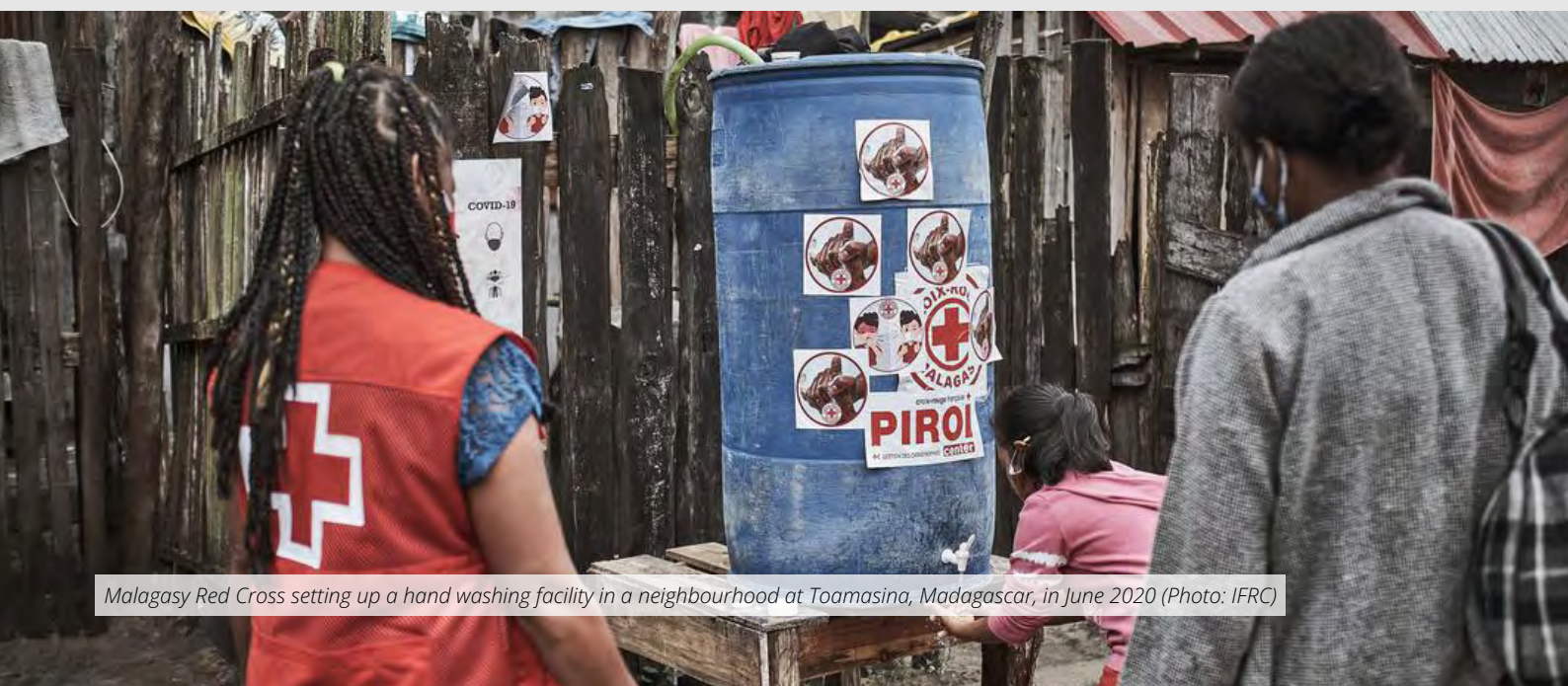
Malagasy Red Cross setting up a hand washing facility in a neighbourhood at Toamasina, Madagascar, in June 2020

The operational strategy integrates in a cross-cutting manner community engagement and accountability (CEA) and protection, gender and inclusion (PGI) as pivotal elements, in an approach that recognizes and values all community members as equal partners, with their diverse needs shaping the response.