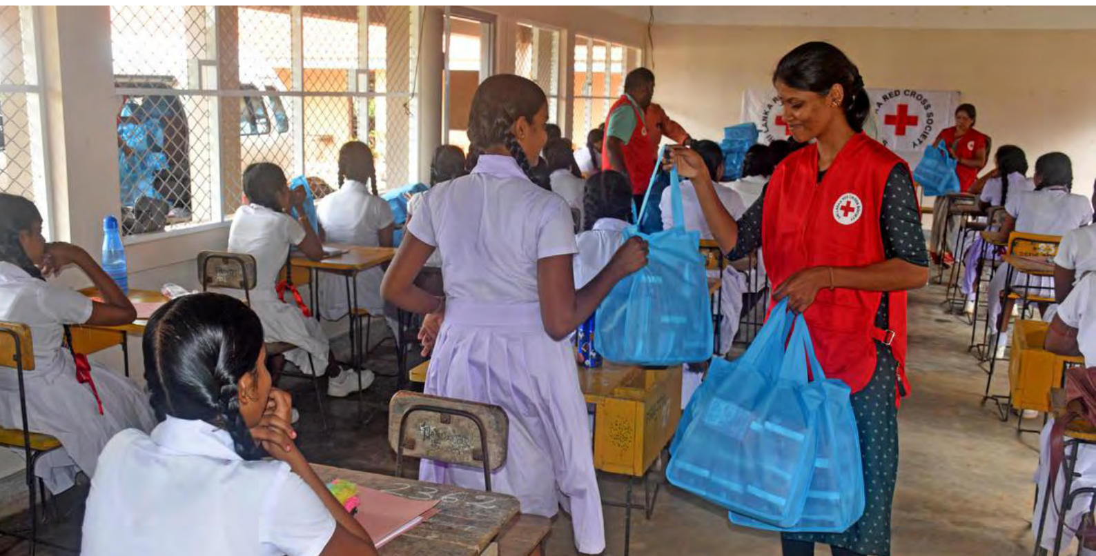
Sri Lanka Red Cross volunteers distribute sanitary napkins in Vavuniya, in December 2022

The ICRC supports the National Society with migration, restoring family links, humanitarian values, safer access, first aid, and the dissemination of international humanitarian law. In Sri Lanka, the ICRC helps people affected by the past conflict, including detainees, the families of missing persons and economically vulnerable households. The ICRC also works with ministries, armed forces, police and universities to promote international humanitarian law and international human rights law.