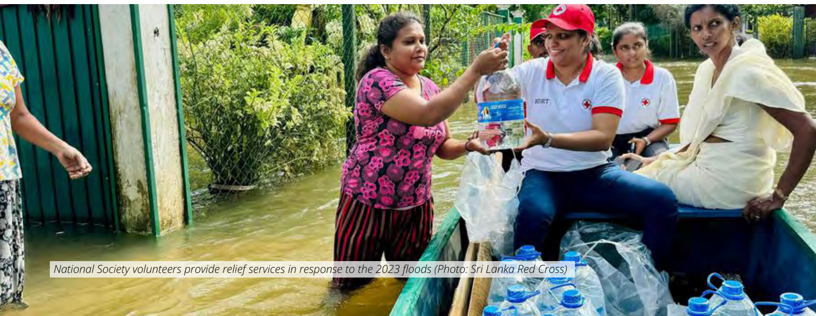
National Society volunteers provide relief services in response to the 2023 floods