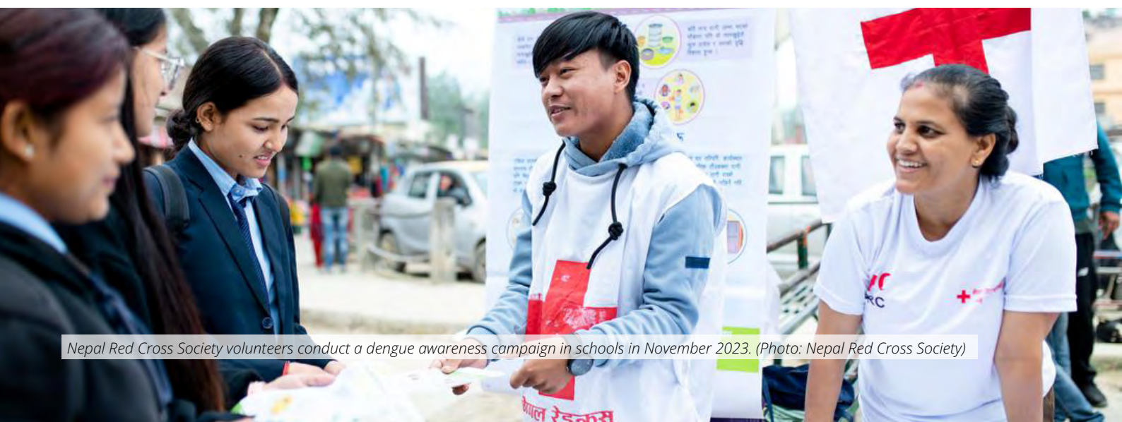
Nepal Red Cross Society volunteers conduct a dengue awareness campaign in schools in November 2023.