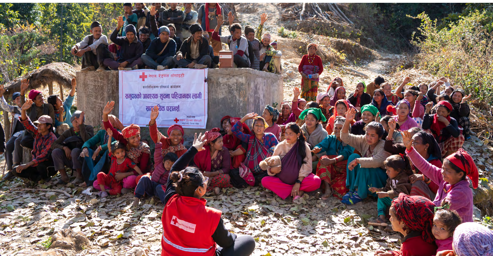
Nepal Red Cross Society volunteers engage with the community in Jajarkot district in February 2024 to identify information needs as part of the Karnali Earthquake emergency operation.

The Finnish Red Cross supports the National Society's by taking a lead role in early warning systems.