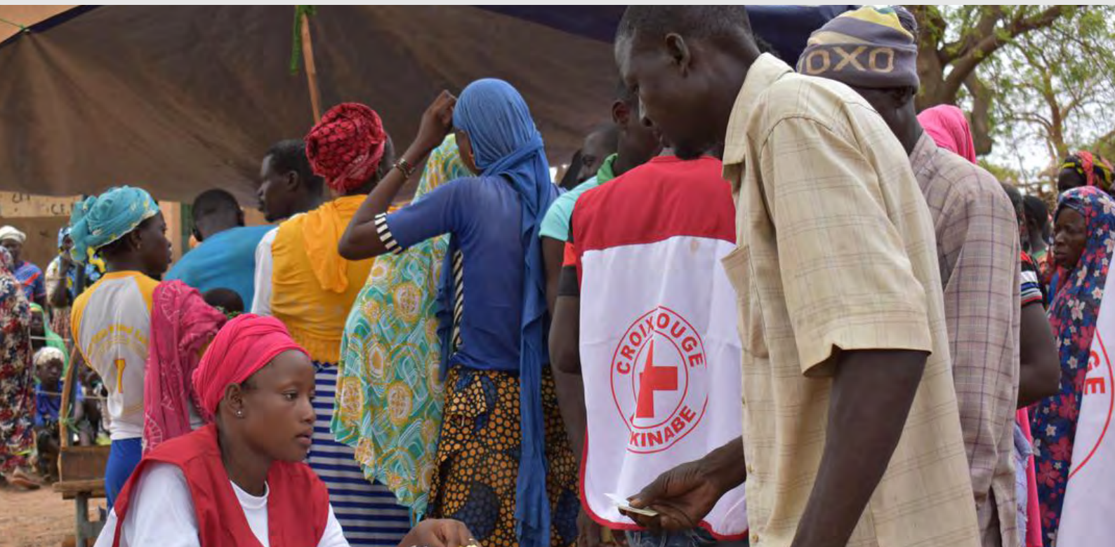
Burkina Faso Red Cross volunteers assisting communities affected by violence and climate shocks, in July 2022.

The operational strategy integrates community engagement and accountability (CEA) and protection, gender and inclusion (PGI) as pivotal elements, in an approach that recognizes and values all community members as equal partners, with their diverse needs shaping the response. Activities includes the provision of dignity kits, and establishment of two-way feedback mechanisms. The strategy emphasizes local voice amplification, collaborative engagement, and transparent communication, extending into long-term resilience building through initiatives such as the IFRC Pan-Africa Zero Hunger Initiative.