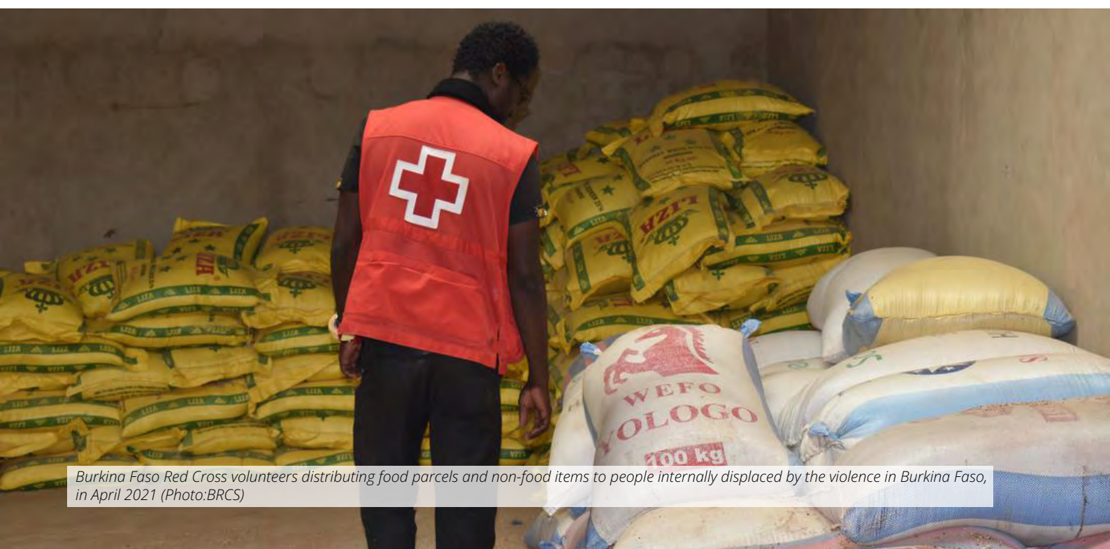
Burkina Faso Red Cross volunteers distributing food parcels and non-food items to people internally displaced by the violence in Burkina Faso, in April 2021

The Red Cross Red Crescent Climate Centre , hosted by The Netherlands Red Cross, also provides technical support to the Burkinabe Red Cross on climate-related issues.