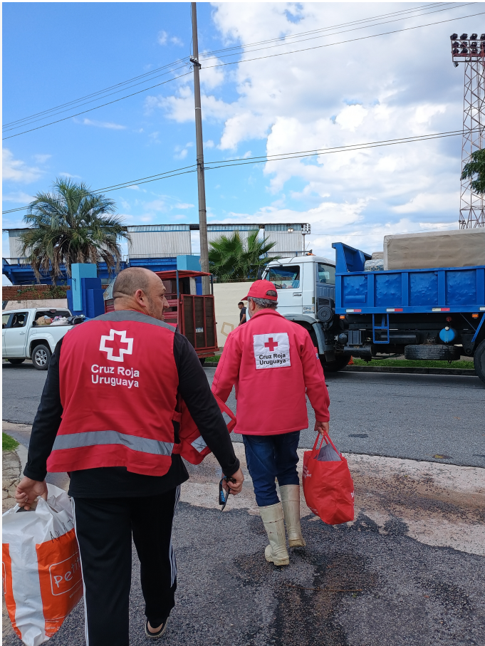
Support in assessment activities and in evacuation centers, San José.

As per reports and forecasts from the National Institute of Meteorology (Inumet), heavy rainfall is anticipated across the country by the end of this week and into the beginning of the following week (starting March 31).