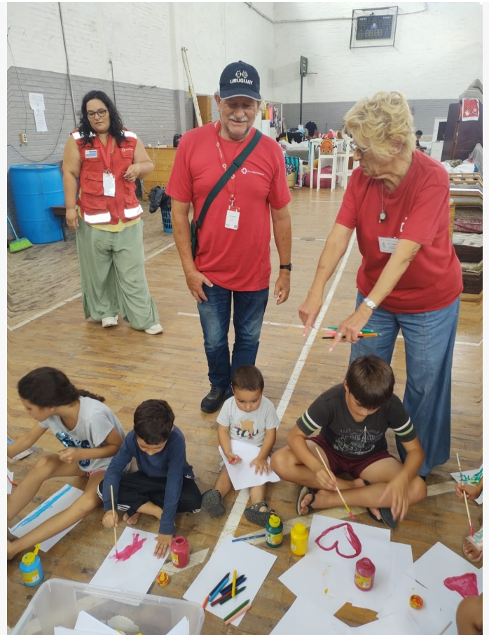
Psychosocial support activities for children in evacuation centers, San José.