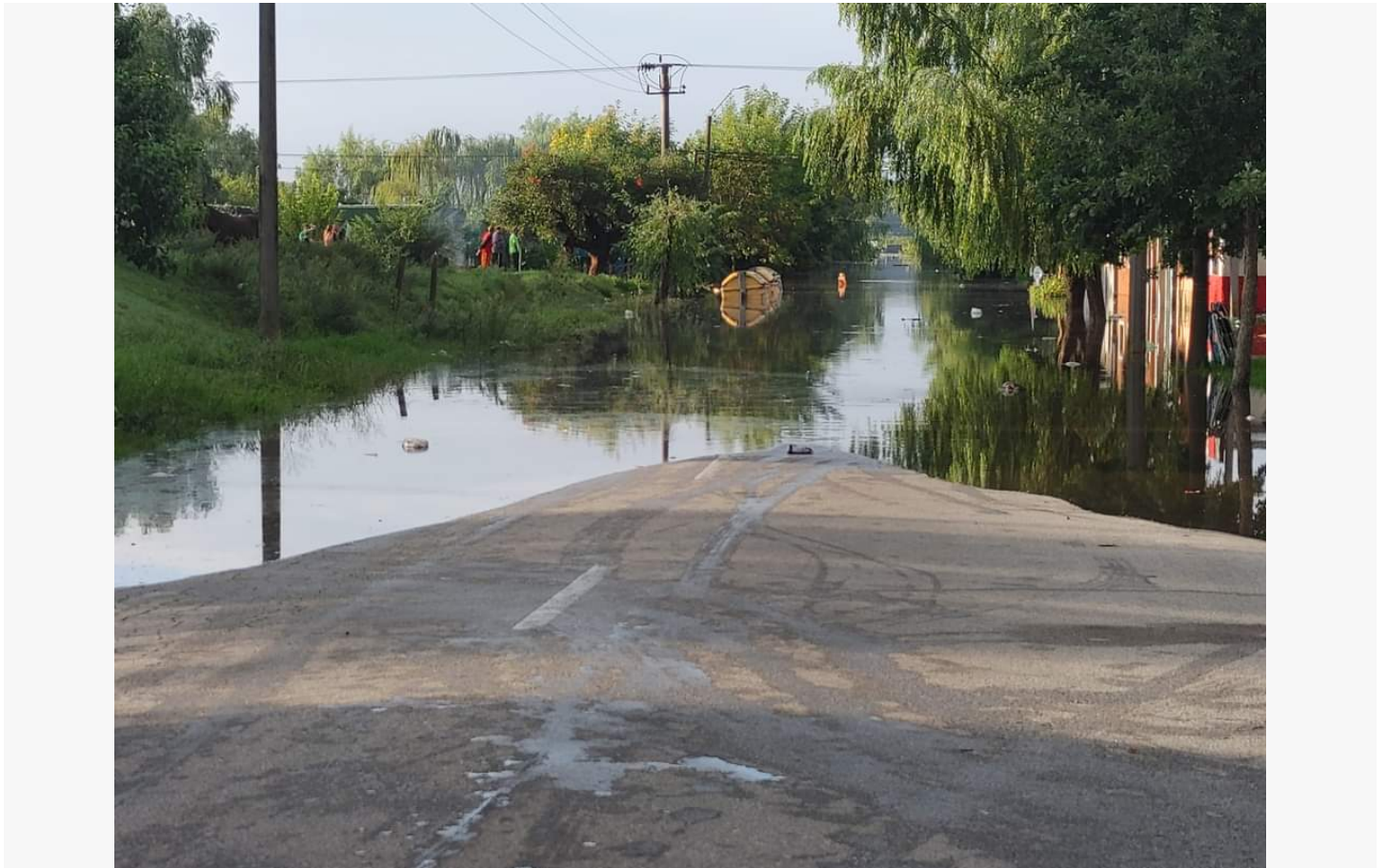
Floods in San José.