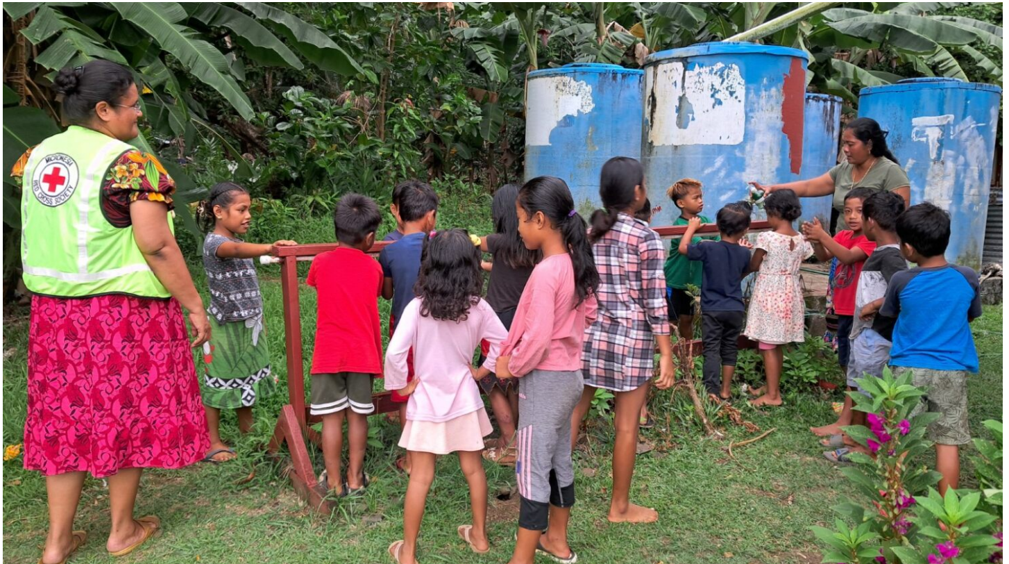
MRCS is engaging both community members and school children in comprehensive awareness campaigns focusing on good hygiene practices, as well as household water treatment and safe storage protocols