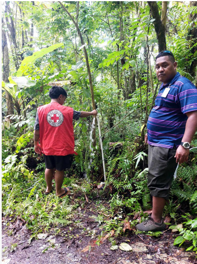
MRCs collaborating with local authorities to install water pipes, ensuring community access to clean water

Health MRCs has developed and printed four sets of Information, Education, and Communication (IEC) materials focusing on the causes and preventive measures for food and water-borne, vector-borne, and skin diseases. Additionally, 40 Red Cross volunteers underwent training on the causes and preventive measures of food and waterborne, vector-borne, and skin diseases. These trained volunteers subsequently conducted awareness campaigns in targeted communities and schools. Moreover, MRCs participated in a Joint Risk Management Network meeting with the FSM Department of Health.