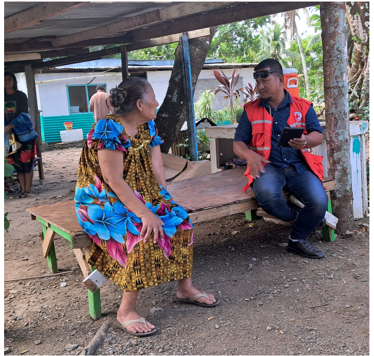
Red Cross reached out the vulnerable families and individuals through a household survey