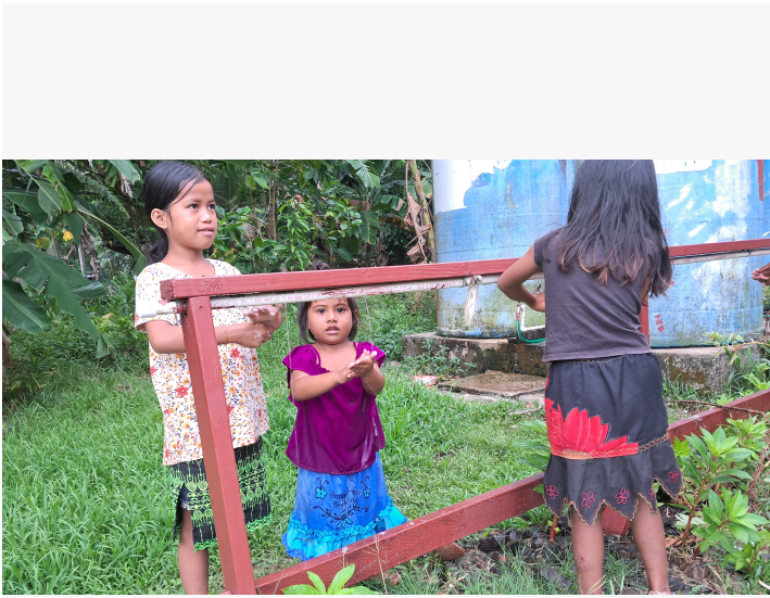
Students in the target schools practiced the handwashing with soap