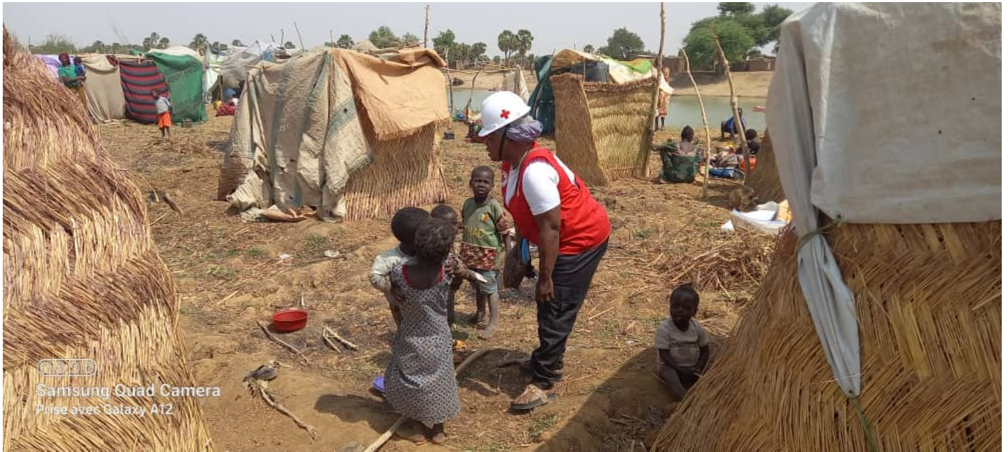
Volunteers assisting displaced population along the riverbank