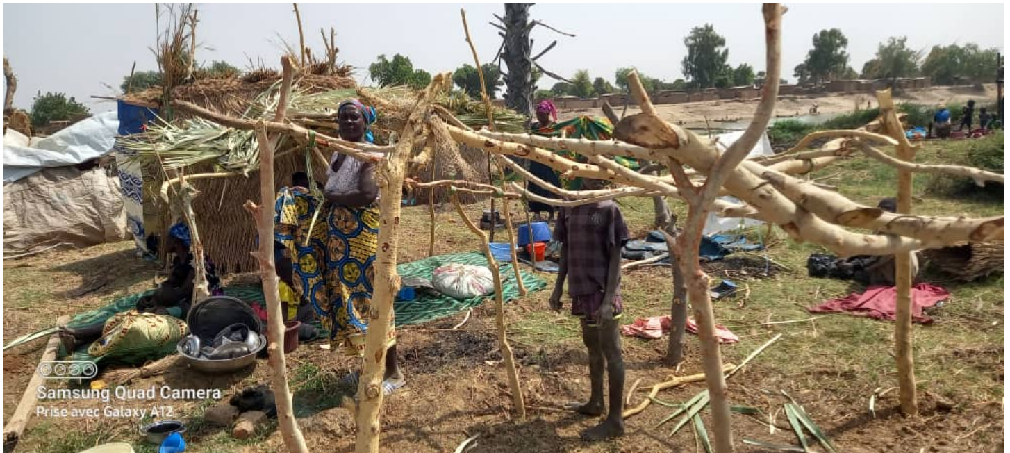
A view of the site at Gala village