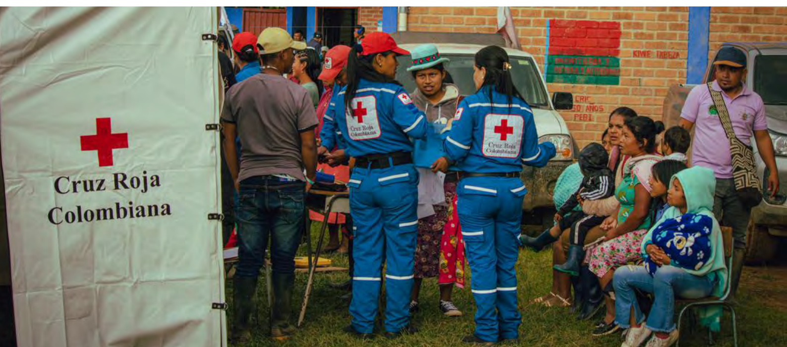
3rd April 2023, The arrival of the Colombian Red Cross delegation was warmly welcomed by the locals of Morales, Cauca who were receiving more comprehensive assistance in their area than ever before.

In Colombia, the ICRC carries out actions to support the victims of conflict and other situations of violence, and those affected by migration. Its cooperation with the National Society includes programmes in safer access, public and operational communications, economic security, health, WASH, restoring family links, protection and education in urban environments, IHL, prevention of and response to sexual violence, and institutional strengthening.