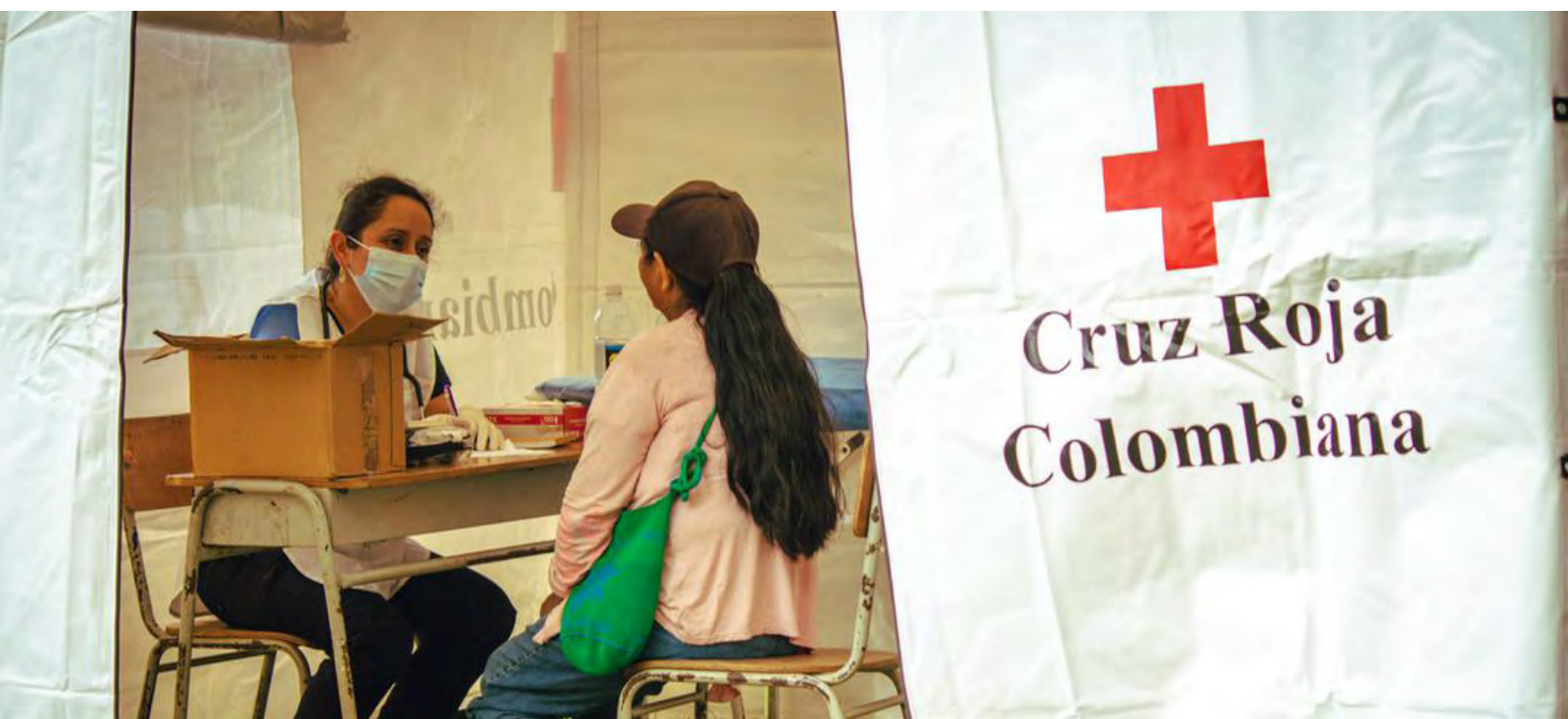
3rd April 2023, The Colombian Red Cross' team of doctors, psychologists, nurses, and volunteers travelled several hours along difficult roads, accompanied by the indigenous authorities, to provide medical care and emotional support to the community.

It is estimated that 7.7 million people are in need of assistance in Colombia as a combined result of armed conflict and violence, displacement and migration, an increase in natural hazards and climate-related events, and an increase in socio-economic needs generated by COVID-19 and inflation.