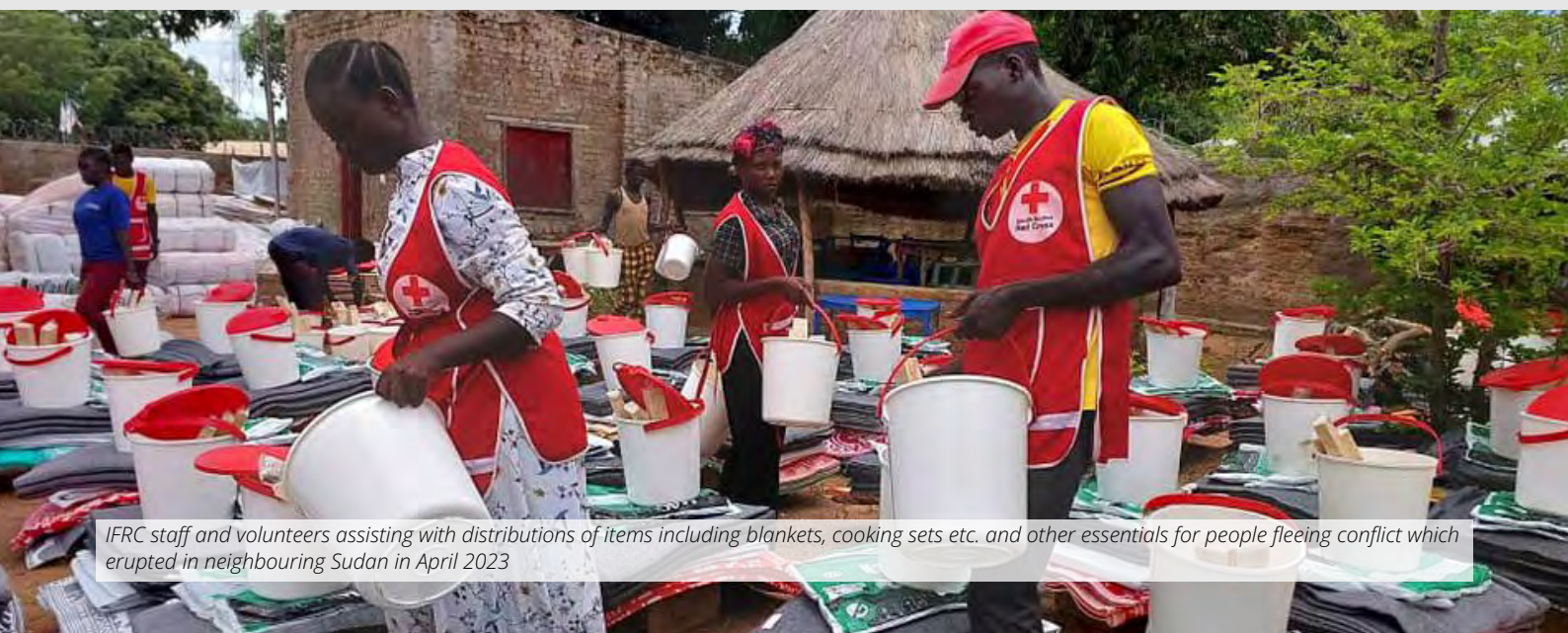
IFRC staff and volunteers assisting with distributions of items including blankets, cooking sets etc. and other essentials for people fleeing conflict which erupted in neighbouring Sudan in April 2023