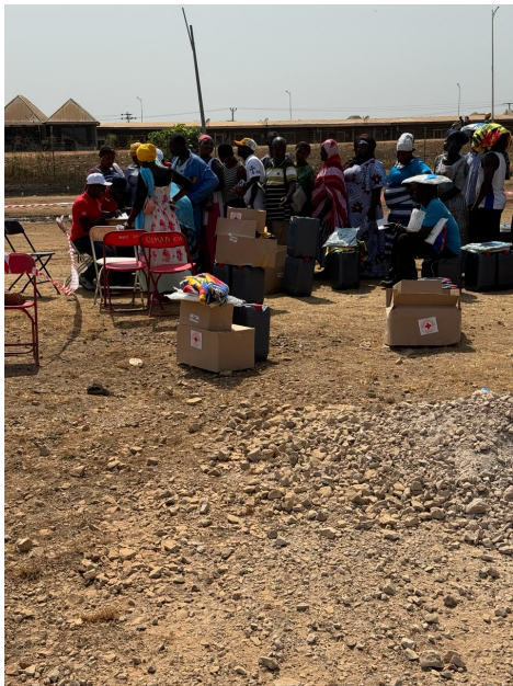
Communities signing off for NFIs received in Buipe community