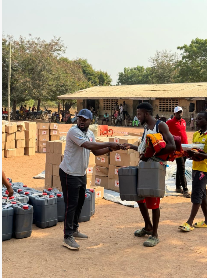
Distribution of NFIs in the Buipe Savannah Region