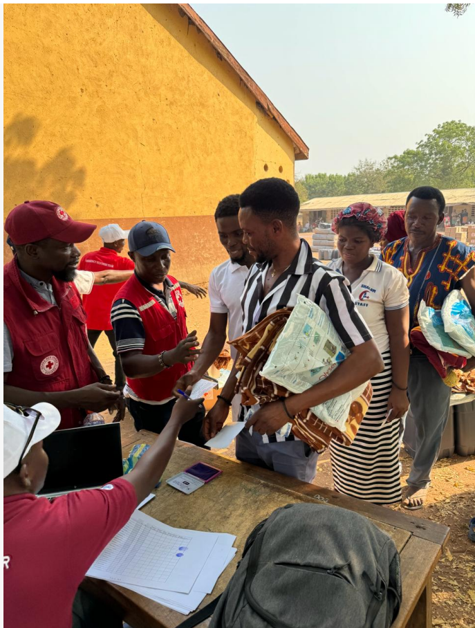
Community members sign for NFIs received in Buipe

In both regions, the displaced populations of 26,000 people have lost their properties, farm products and means of livelihoods. Successive impacts and continuation of rains are still putting the North in additional risk of flooding.