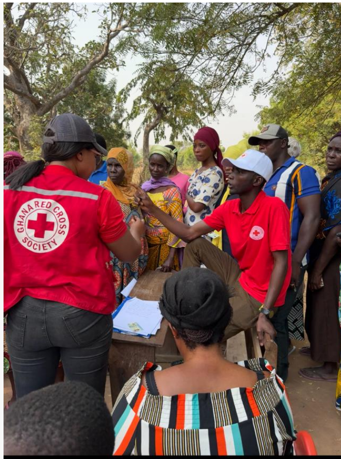
CEA desk receiving feedback and complaints in savannah region