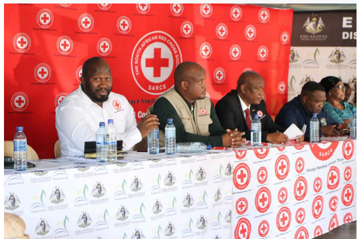
CVA launch in Mpumalanga province