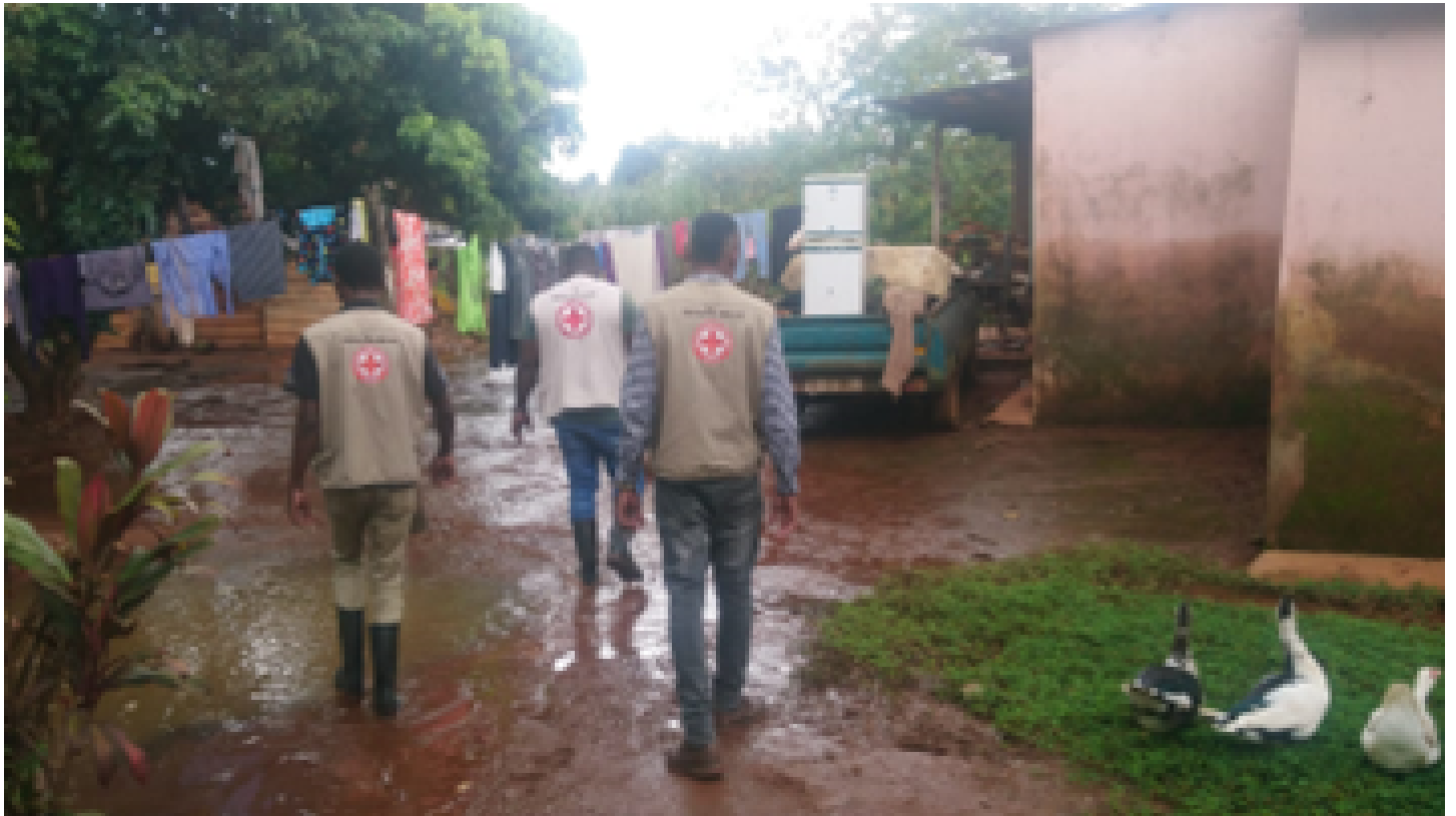
SARCS staff and volunteers conducting Assessment