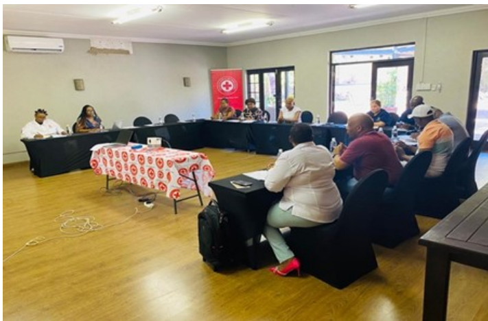
SARCS Staff, Volunteers collaborating with stakeholders conducting lessons learnt Workshop.

Through the DREF, the National Society has been providing support to 12,500 people (2,500 households) through this intervention.