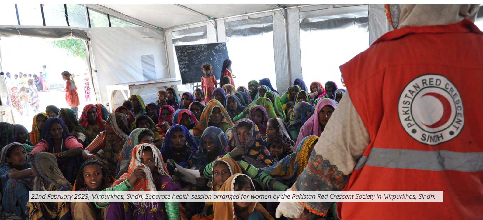
22nd February 2023, Mirpurkhas, Sindh, Separate health session arranged for women by the Pakistan Red Crescent Society in Mirpurkhas, Sindh.

In Pakistan, the ICRC supports the public, the authorities and the Pakistan Red Crescent in the event of armed violence and joins efforts in disasters. It also provides structural, and programme support to targeted district branches of the Pakistan Red Crescent as part of its ongoing action.