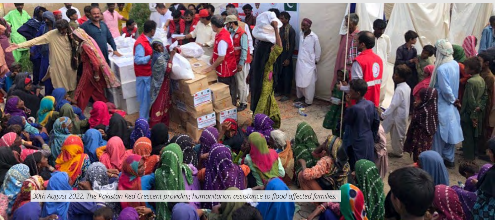
30th August 2022, The Pakistan Red Crescent providing humanitarian assistance to flood affected families.

In view of the dire humanitarian needs, the IFRC launched an Emergency Appeal July 2022 (revised in October 2022) in support of the Pakistan Red Crescent's response to the emergency. The revised appeal seeks CHF 40 million (Federation-wide funding requirement: CHF 55 million) to assist one million people affected by the floods. By end of 2023, the IFRC Emergency Appeal was funded at 60%. The ongoing operation is projected to end on 31 December 2024.