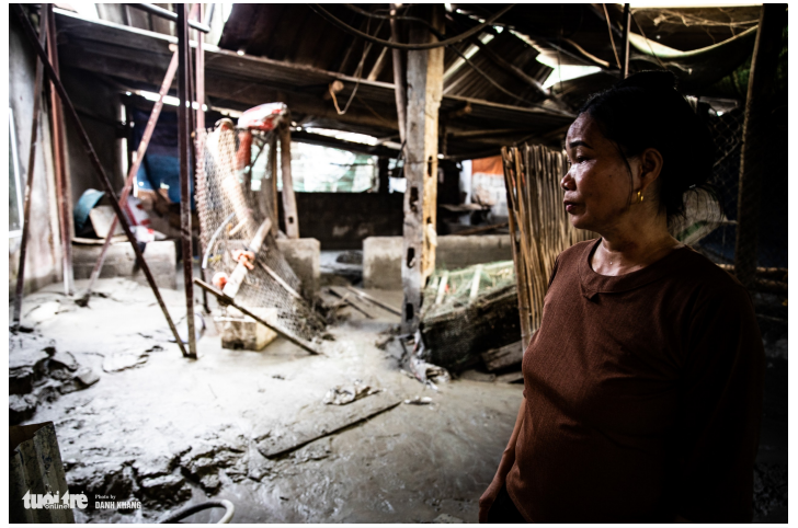
Condition of a house damaged by the flash flood