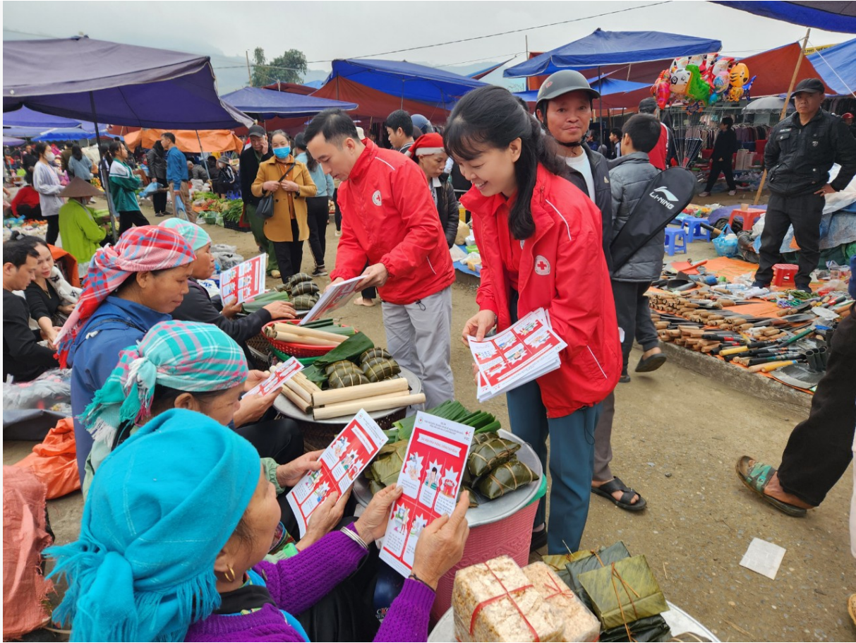
VNRC personnel conducting WASH and Health promotion dissemination in Lao Cai province, January 2024