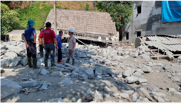
VNRC and local authorities conducting visits to affected people