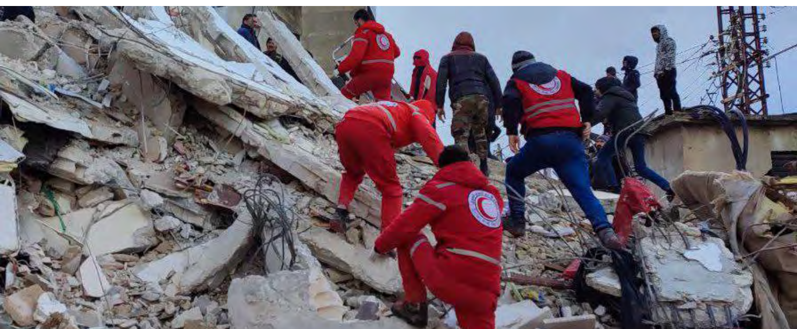
Syria, 10th February 2023. Syrian Arab Red Crescent workers rescue and provide first aid to people after buildings collapse due to the earthquake in Lattakia.

Delivering uninterrupted and needs-based humanitarian aid in Syria remains highly challenging due to its fluid security and political context. With no common political agreement between international actors and the Syrian Government, resources and support for humanitarian work are diminishing, leaving millions of Syrians in an extremely vulnerable situation.