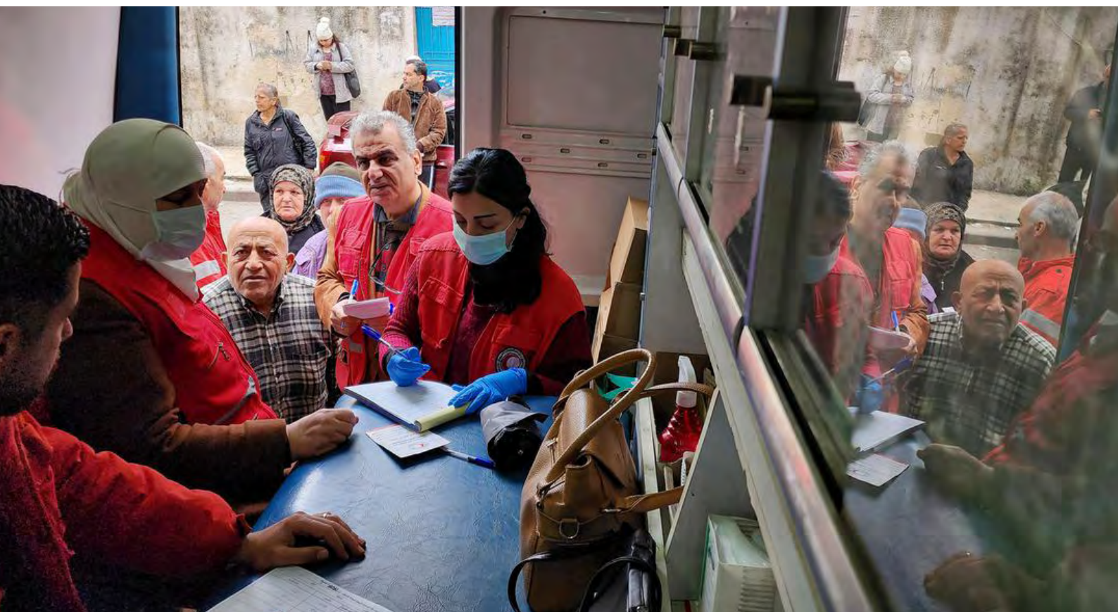
Syrian Arab Red Crescent Mobile Health Unit doctor tells about the health situation in Latakia, Syria

The Danish Red Cross will support the broader initiatives of the Red Cross and Red Crescent partners in Syria, aiming to foster innovation and digital transformation in the Syrian Arab Red Crescent.