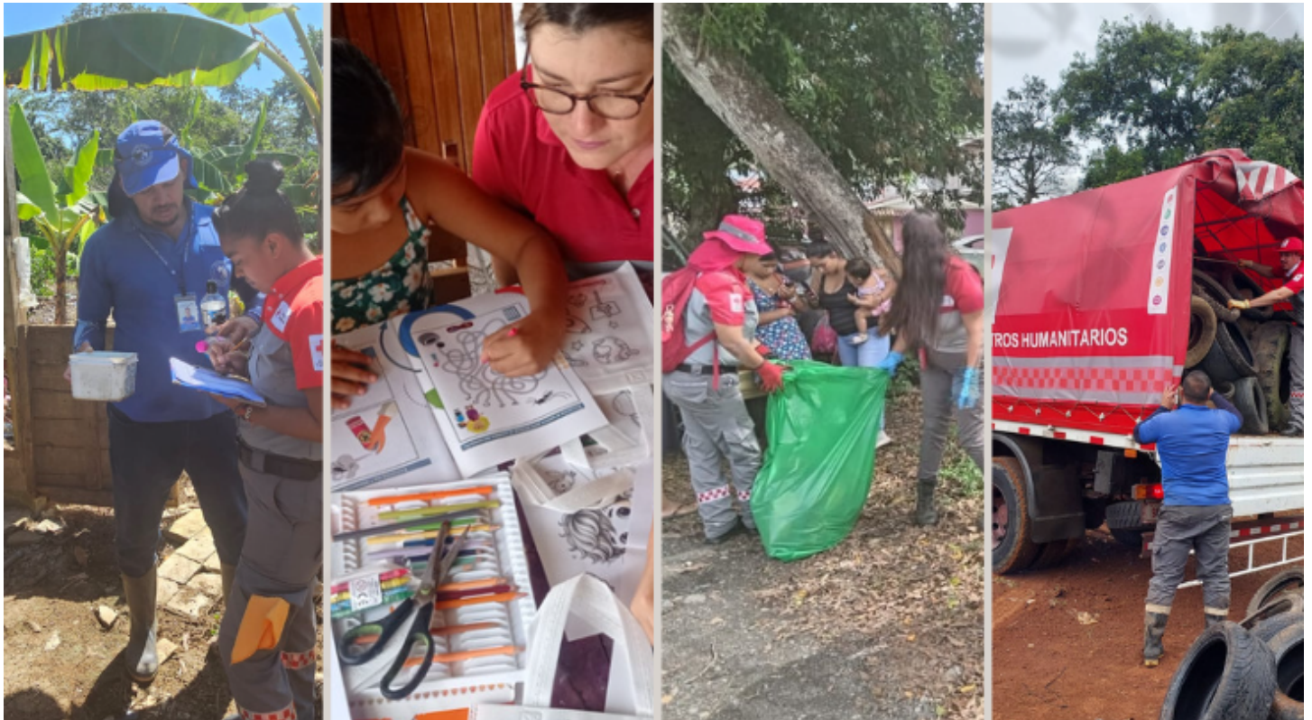
Implementation of actions by Costa Rican Red Cross volunteers within the framework of the IFRC-DREF.