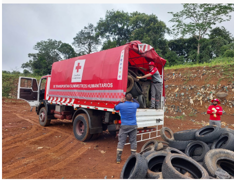
Cleaning day in coordination with the Ministry of Health.