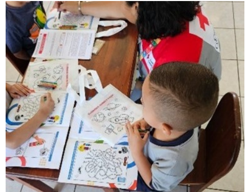
Talks in educational centers on dengue prevention.