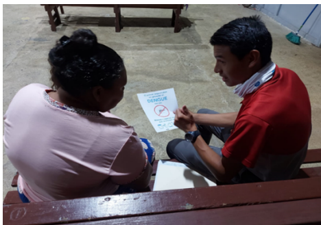
Community talks on dengue prevention.