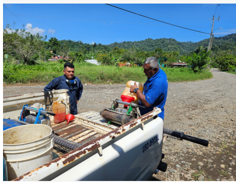
Fumigation day in coordination with the Ministry of Health.