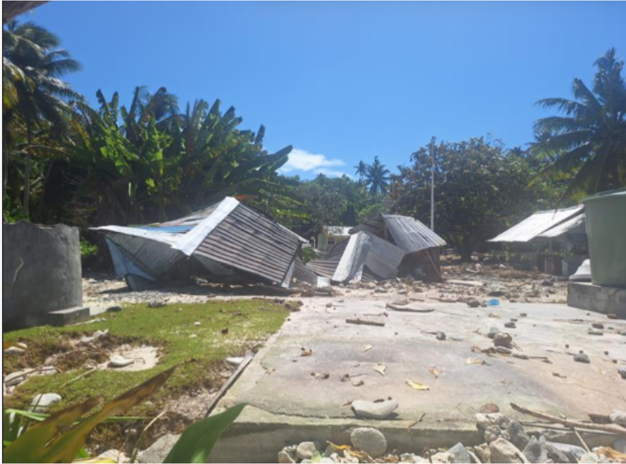
Damages caused by the Winter Storm Swell