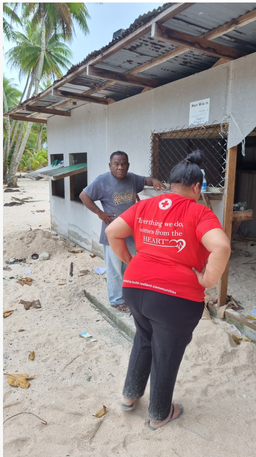
MIRCS team assessing the Impact of the Winter Storm Swell