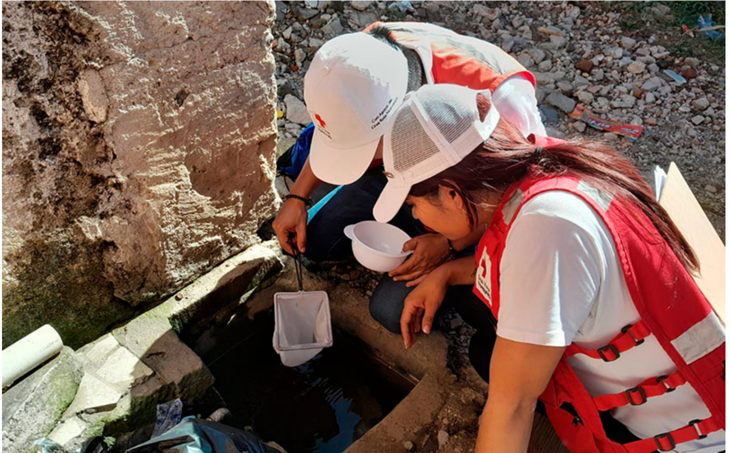
Development of the larval index in one of the affected communities.