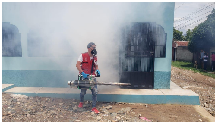
Fumigation campaign in one of the areas affected by dengue.

(3) https://www.paho.org/es/documentos/alerta-epidemiologica-circulacion-sostenida-dengue-region-americas-5-diciembre-2023