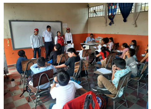
Informative talks at an educational center on dengue prevention actions.