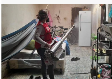
Fumigation campaign in one of the homes of a community affected by dengue.