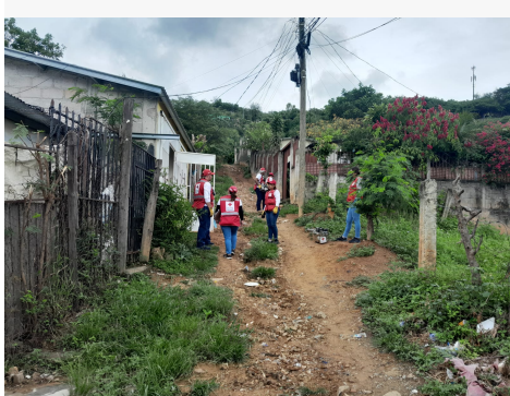
Home visits to share information related to dengue prevention.