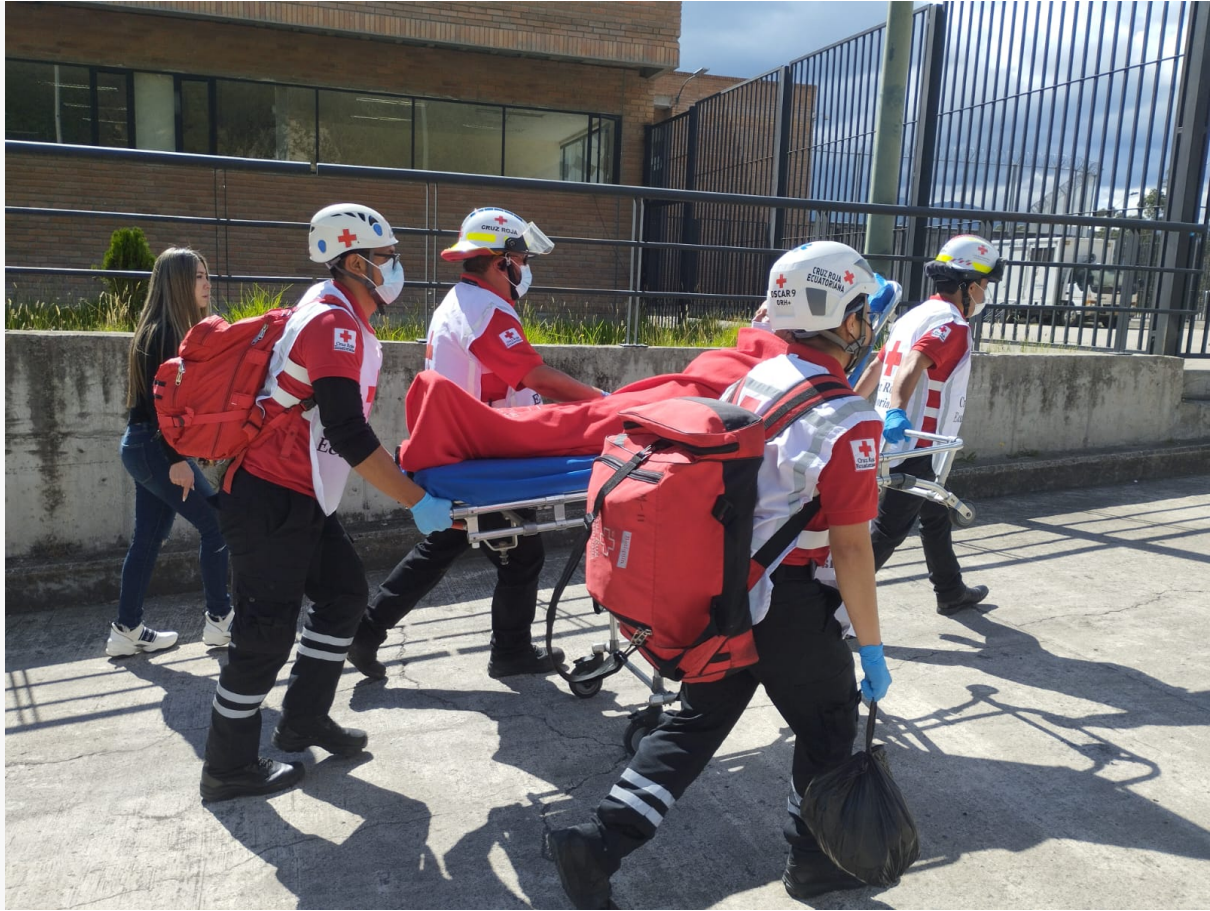
Pre-hospital Care Services in Cuenca