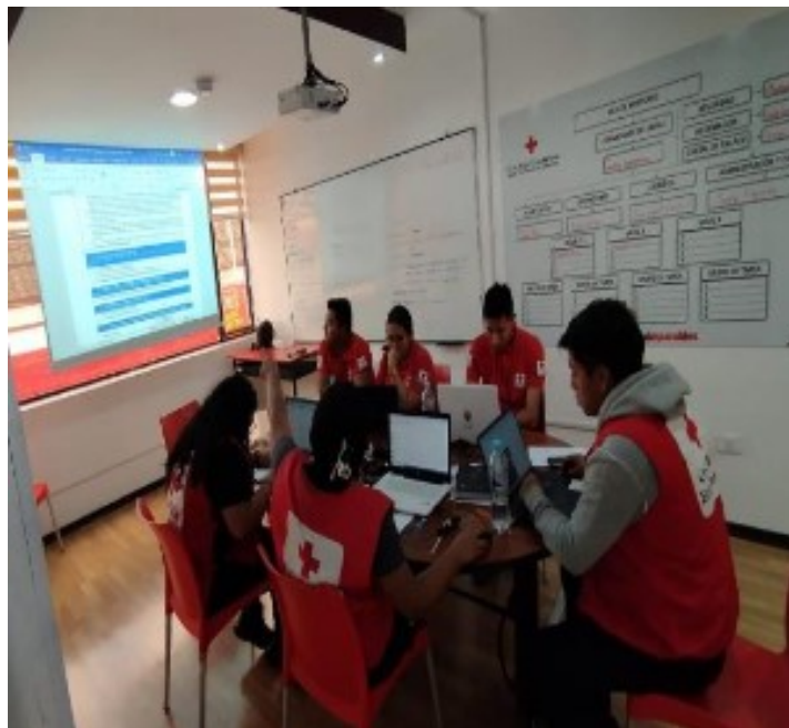
Situation Room Activation in Imbabura Branch