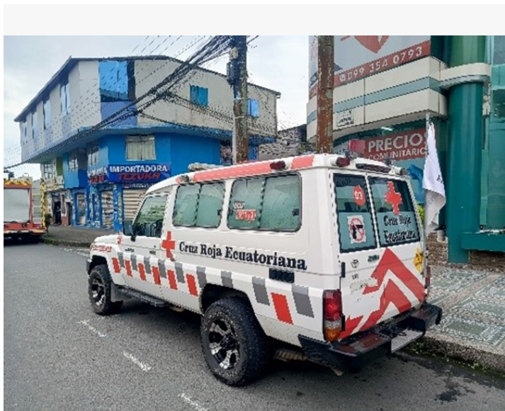
Ecuadorian Red Cross Ambulance with institutional branding, Santo Domingo de los Tsáchilas

On January 14, SNAI stated that inmates held 158 guards and 20 administrative staffers in at least seven prisons have been freed (7).