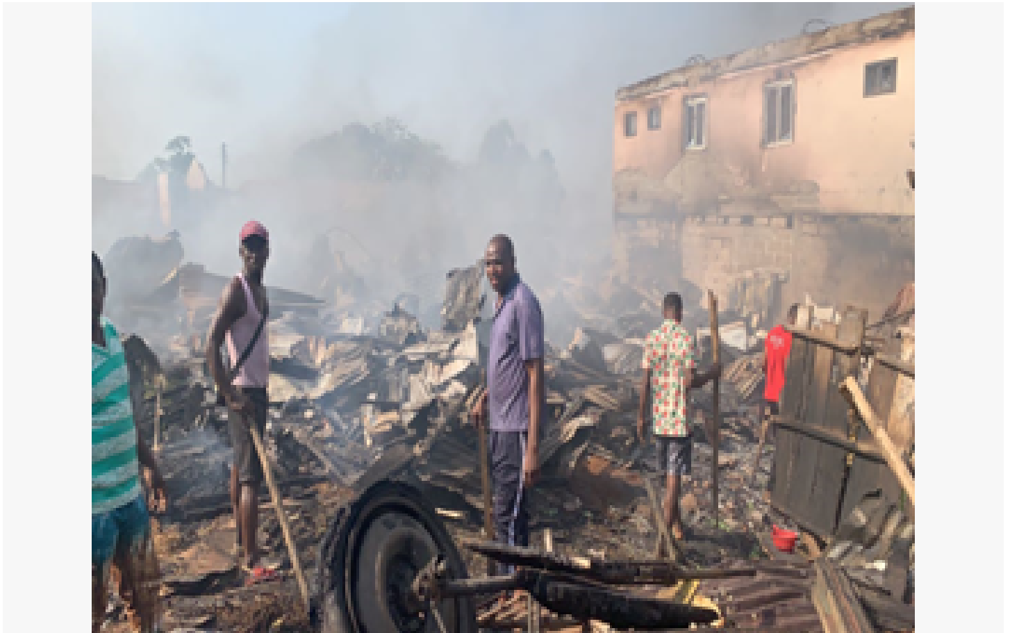
image of burning houses during the incident