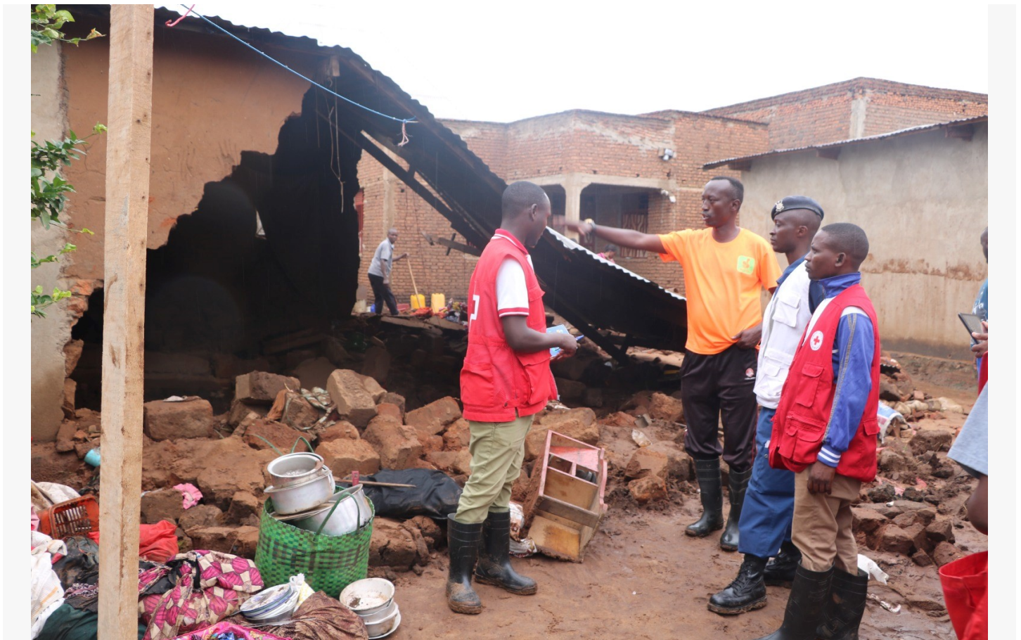
Rapid assessment in Bujumbura