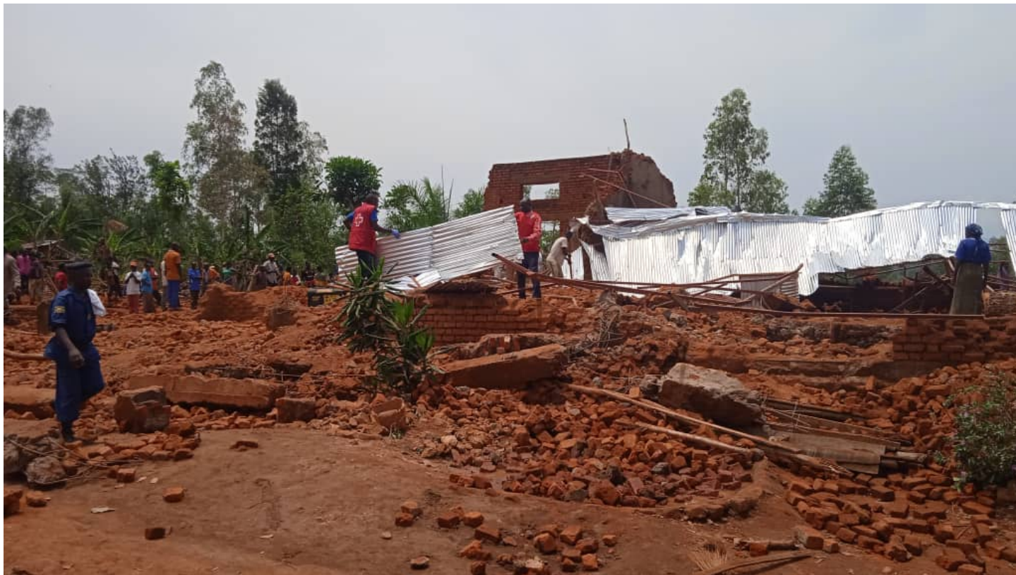
BRC volunteers are rescuing the victims of the heavy rains and winds in Makamba.