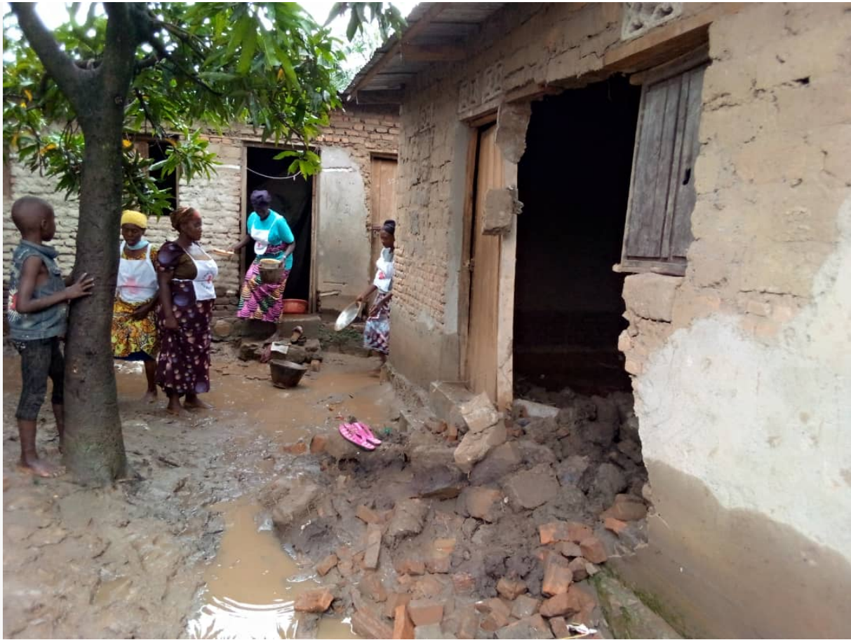
Rainwater drainage in houses