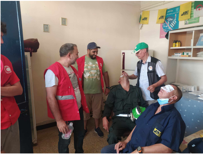
ARC volunteers helping individuals affected by the fires