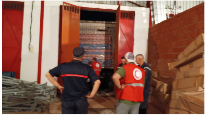
ARC volunteers during the distribution process