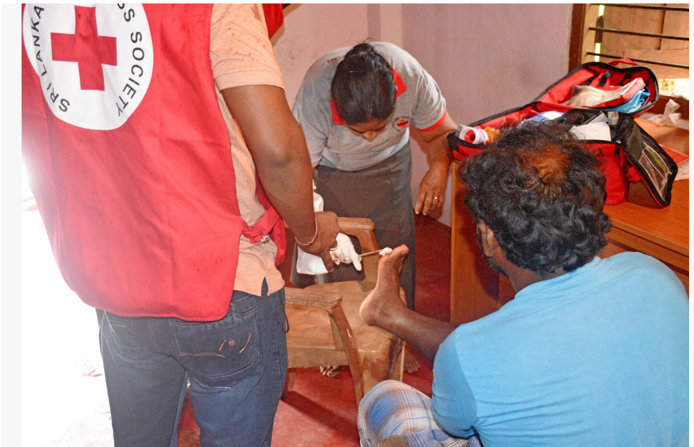
The volunteers from Mullaitivu branch providing first aid services to flood affected people at temporary safety center.