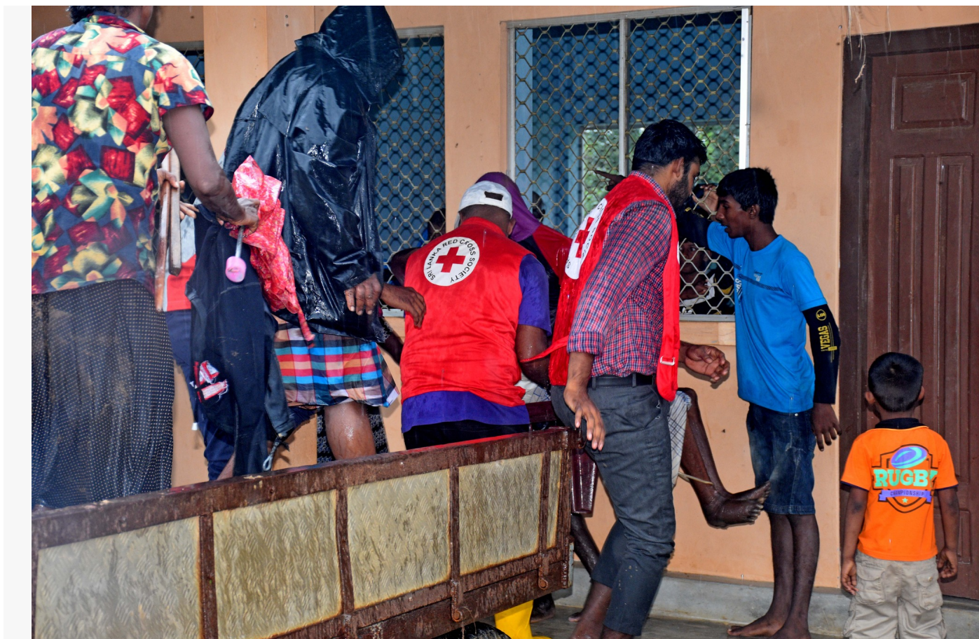
Volunteers from the SLRCS Mullaitivu branch providing transport services to the affected people to bring them in the safer centers