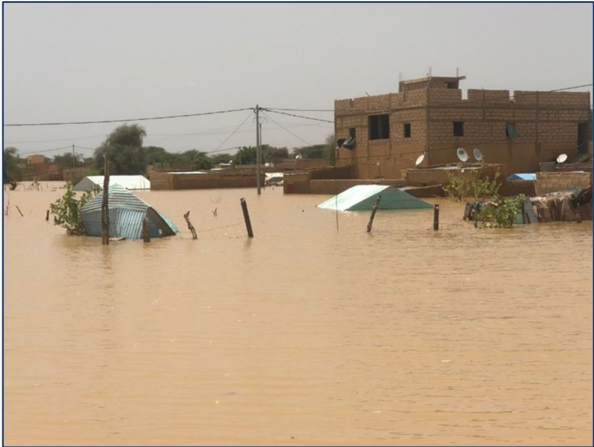
Houses floods up to the roof in Boghe