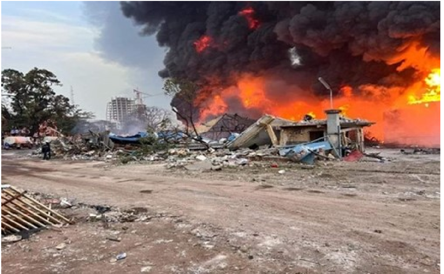
Guinea Kaloum Fire