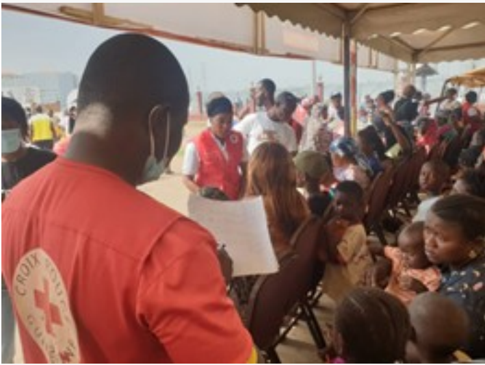
Red Cross support registration and assessment