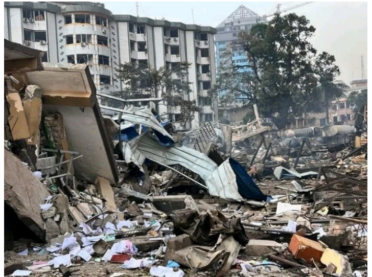
Houses destroyed by the fire