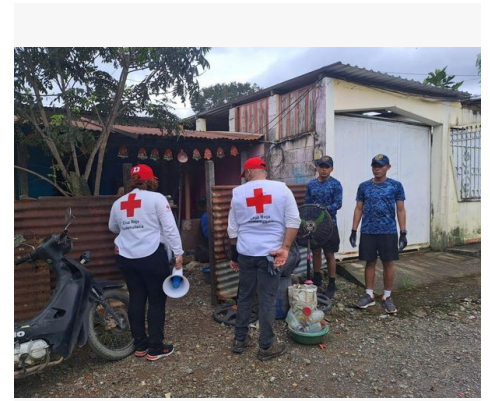
Waste cleanup day in a community of Izabal.