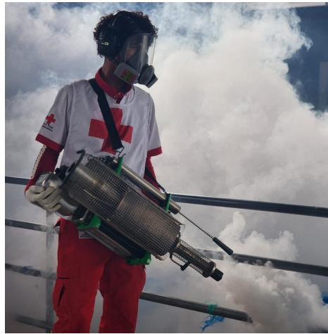
Fumigation day at educational center: Source GRC.