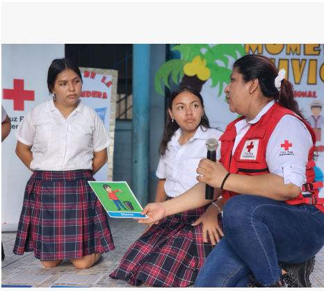
Educational session on dengue prevention measures: Source: GRC.