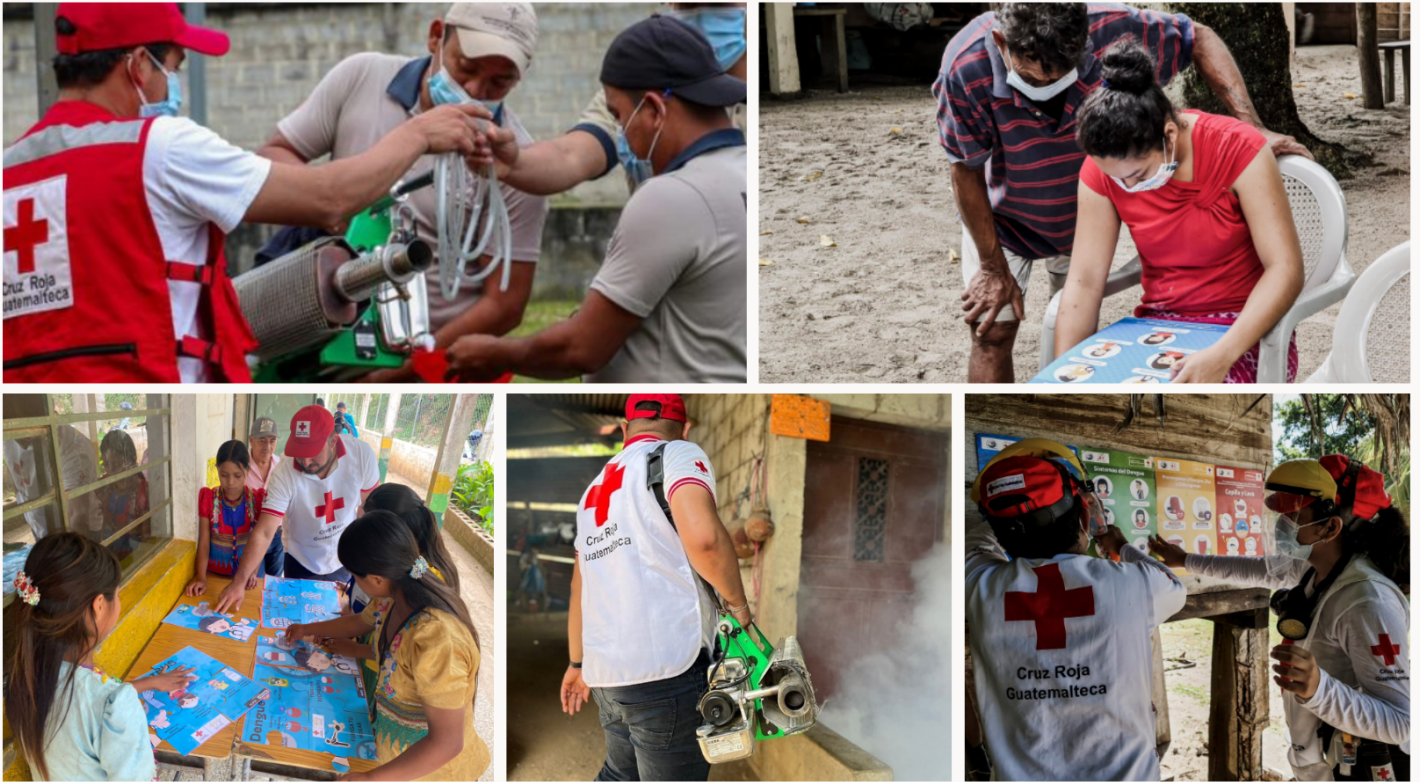
Implementation of actions by Guatemalan Red Cross staff and volunteers: Source: GRC.