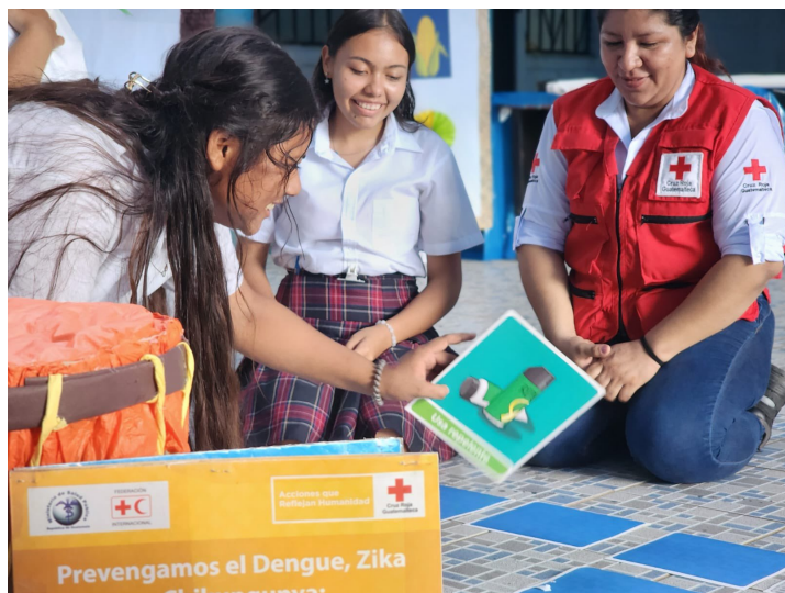
Educational session on dengue prevention in an educational center in Morales, Izabal.