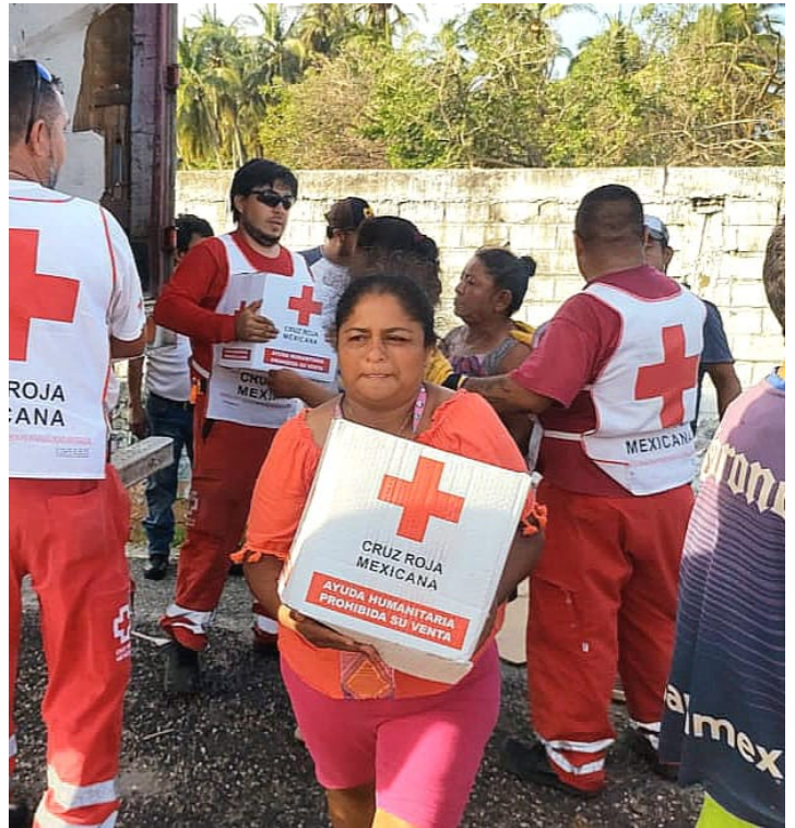
Mexican Red Cross distributing humanitarian assistance - 29 Oct 2023