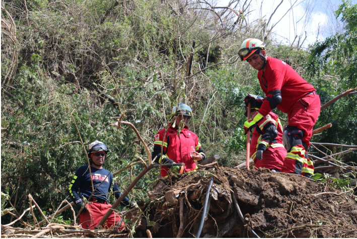
Mexican Red Cross USAR teams carry out search and rescue activities - 29 Oct 2023.