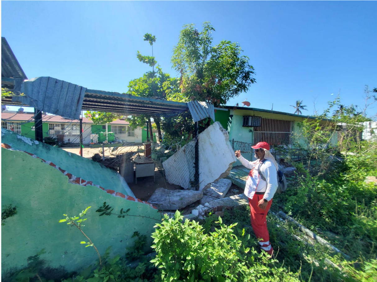
Damage and Need Assessment - Coyuca, Guerrero.