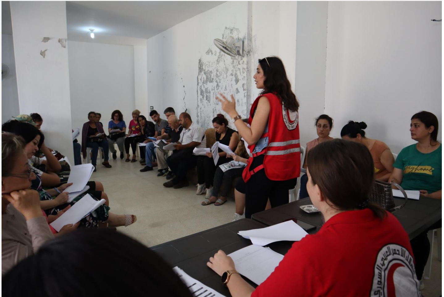
Basic business management skills training in Lattakia.

The provision of cash to renew, rehabilitate, or protect equipment, supplies, and infrastructures enables households to restart their income-generating activities will ultimately contribute to the economic recovery and stability for the earthquake-affected families. On the other hand, the basic business management skills training aims to equip participants with the knowledge and skills necessary to manage their businesses effectively, potentially leading to improved productivity and profitability. Since this marks the initial month following the distribution of the first instalment of conditional cash, upcoming monitoring visits will be conducted to evaluate the progress, impact, and sustainability of the project on the businesses.