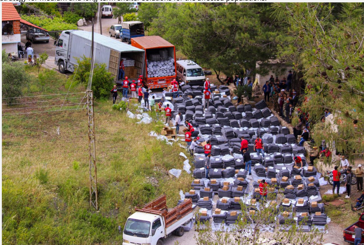
Distribution in Lattakia.

The IFRC also supported SARC with emergency shelter items received in-kind from the European Humanitarian Response Capacity mechanism. On February 26, 2023, a plane cargo of relief items comprised of tents, stoves, tunnel tents, ropes, and tarpaulins from ECHO arrived in Syria for the response to the earthquake. This was the first plane with relief items to land directly from the EU in Damascus since the start of the crises in 2012. The in-kind emergency shelter relief items were distributed to earthquake-affected and vulnerable households in Aleppo, Lattakia and Ar-Raqqa. Shelter specialists were deployed in the first months of the response through the IFRC global human resource surge mechanism to assess, analyze, and recommend suitable shelter solutions for midterm stays of displaced people. Feasibility assessments and design of pre-fabricated shelters started during the reporting period. Overall, the implementation of shelter solutions was not without its challenges due to initial lack of national strategy for medium and long-term shelter solutions for the affected populations.