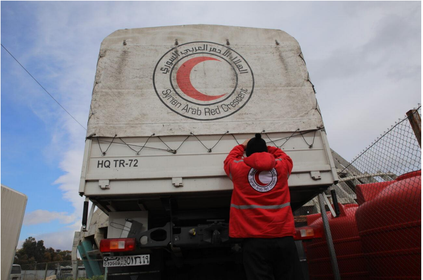
A truck being loaded with distribution items in Damascus – Masar warehouse.