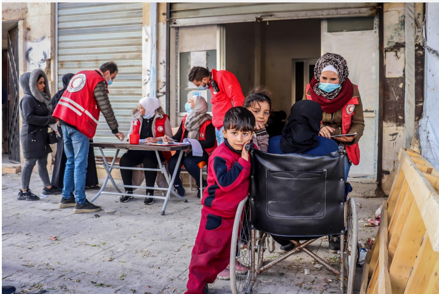
SARC Volunteers supporting Cash distributions.

Post-distribution monitoring is in progress, and the results, including outcome indicators and findings, will be documented and reported in the upcoming reporting cycle.