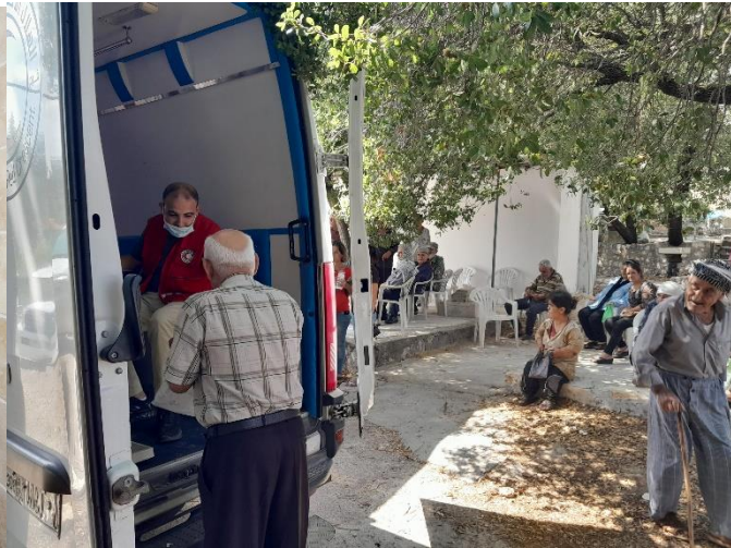
Mobile Health Unit at Tartus village