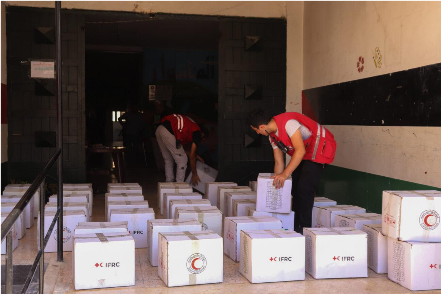
SARC staff and volunteers preparing for distribution of hygiene kits.