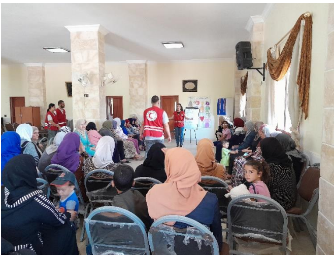
Health promotion session at community hall