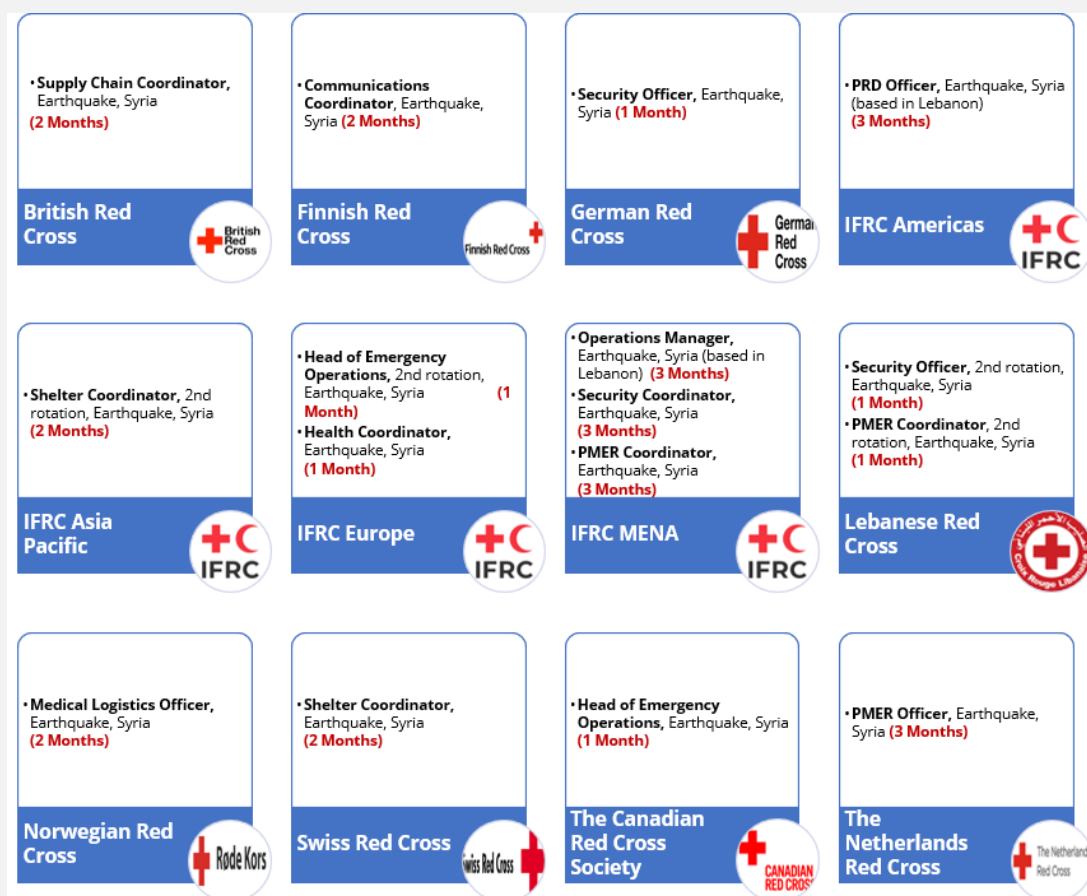
Deployments through IFRC Global Surge Mechanism

Delegate, Security Delegate, Risk Management Delegate and a Health Coordinator seconded from the Japanese Red Cross.