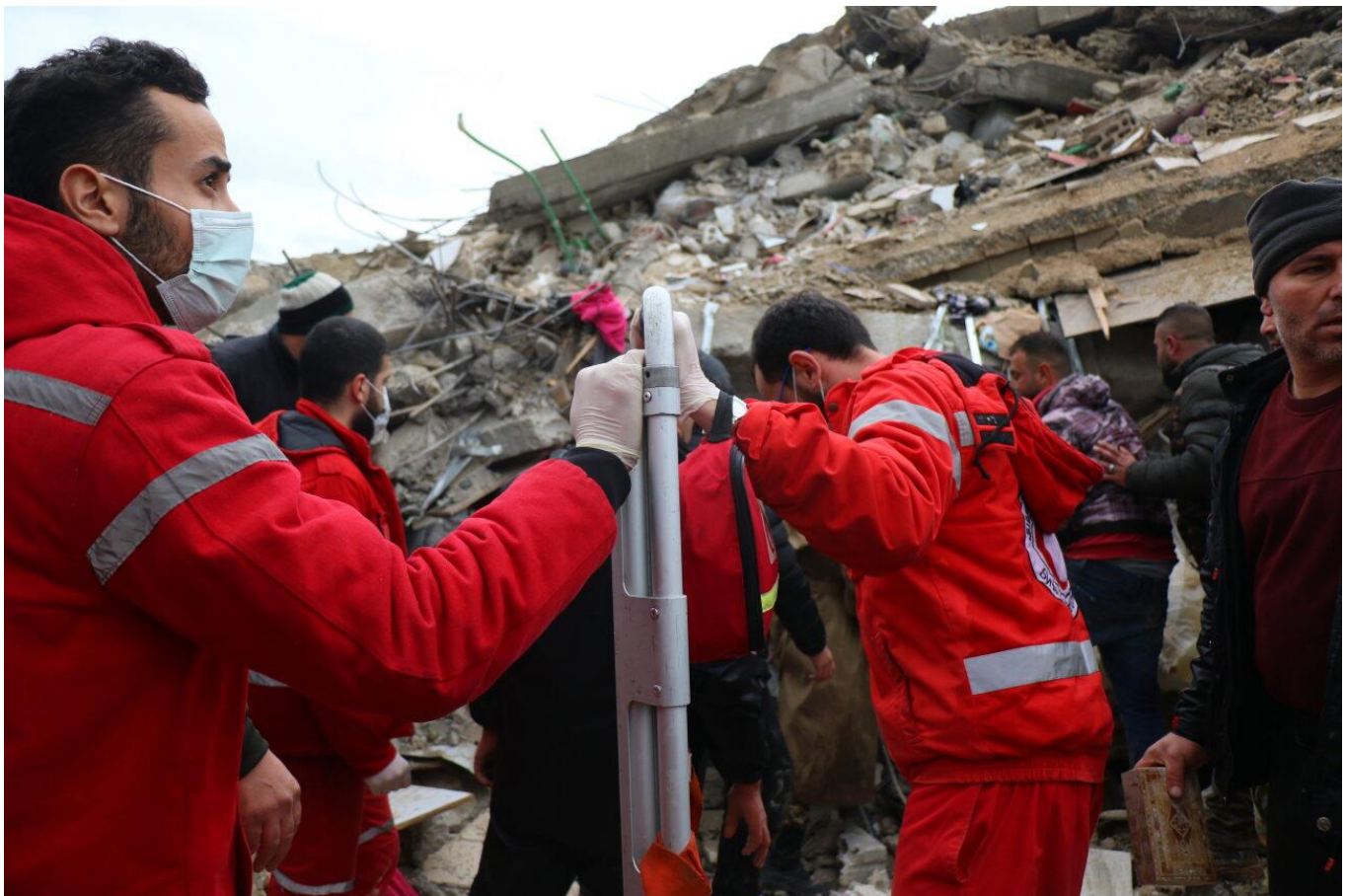
SARC Volunteers providing First Aid services after the earthquake.