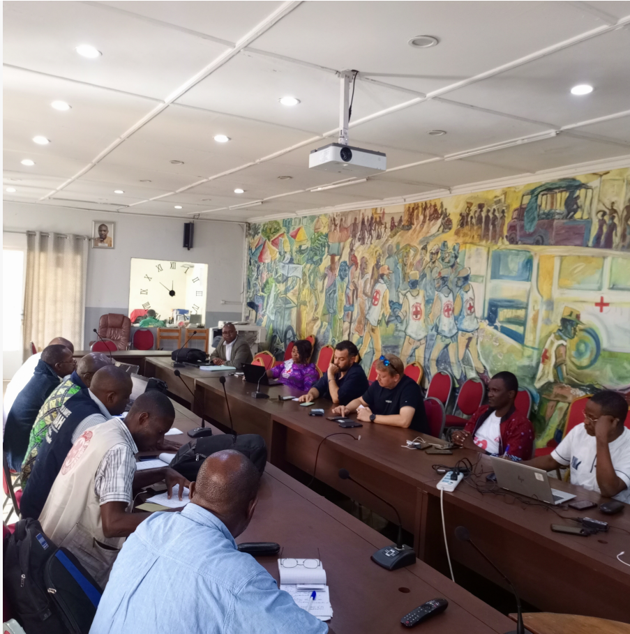
Coordination meeting with partners