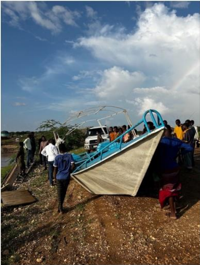
Rescue boat provided by the Ethiopian Disaster Risk Management Commission, to the Shabelle Zonal Administration.

multiple impacts of flood and land slide. The support already provided in these areas is less than 20% despite the magnitude of the impact. Other areas, Afar and SNNP also have gaps in the needs however, ERCS will mobilize from mother partners.