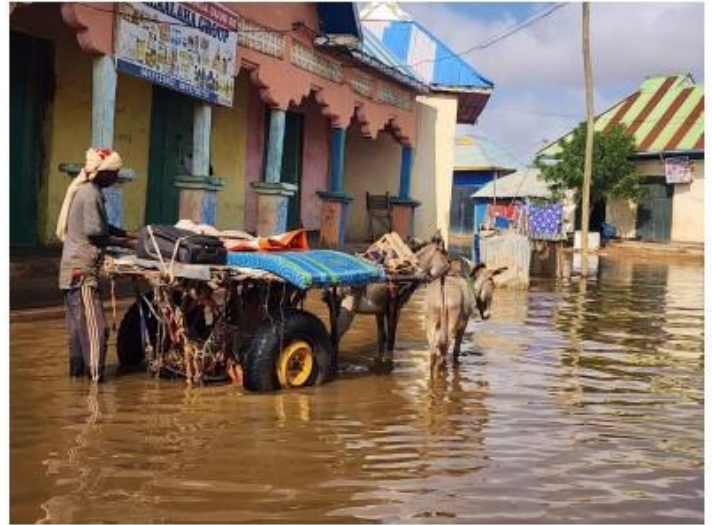
Dolo Ado, Somali Region. Community member tries to save his household items from floods.

Rescue boat provided by the Ethiopian Disaster Risk Management Commission, to the Shabelle Zonal Administration.