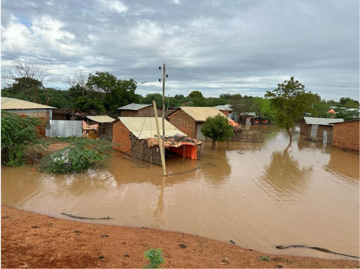
Somali region Flood impact