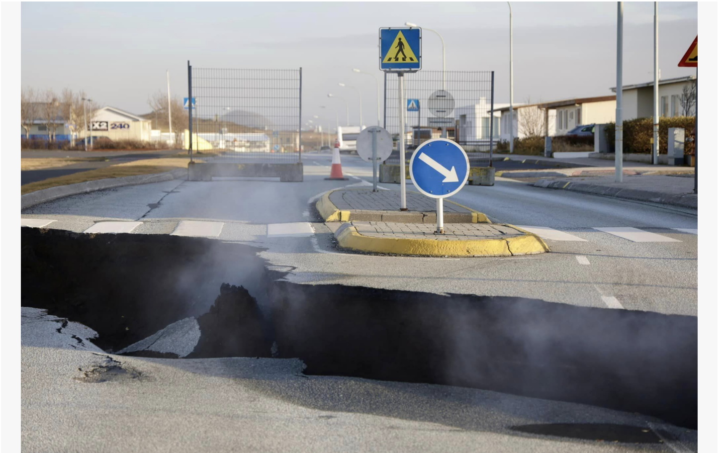
Grindavik - Rift valley forming 12 November 2023