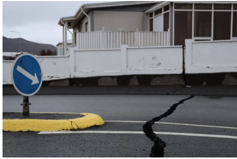
Rift valley formation in Grindavik

change the scope of the event. Residents would lose their habitat permanently. If a volcanic eruption would occur off coast, an explosive eruption might be expected with widespread ash distribution in South West Iceland.