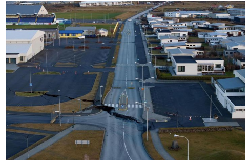
Rift valley formation in Grindavik