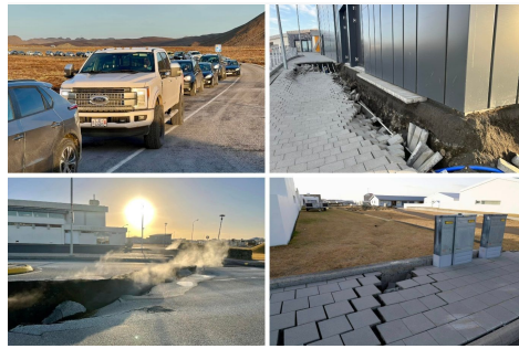
Evacuation and rift valley formation