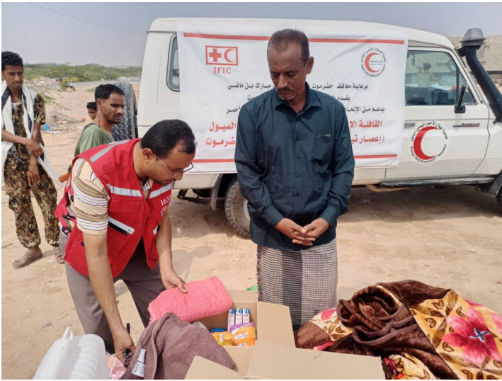
YRCS NFIs distribution in 2023 flood affected areas under DREF response.