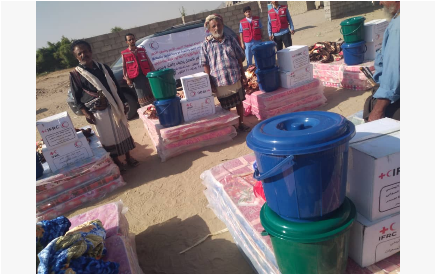
Photo credit: YRCS-Shabwa Governorate-YRCS NFIs distribution in 2023 flood affected areas under DREF response.