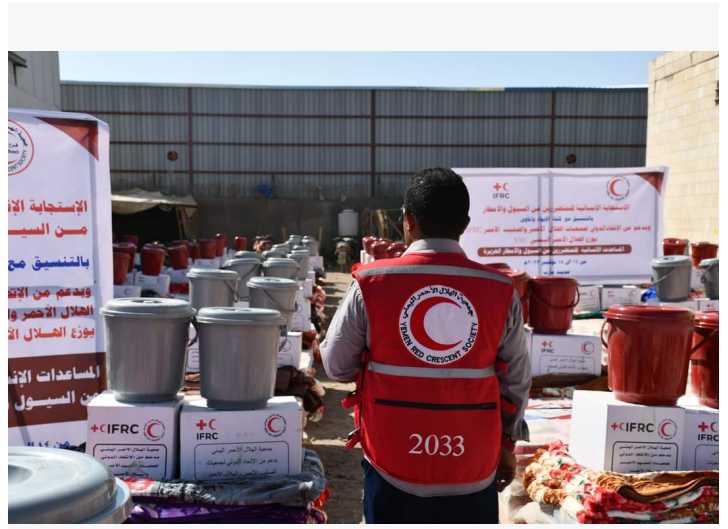
YRCS NFIs distribution in 2023 flood affected areas under DREF response.