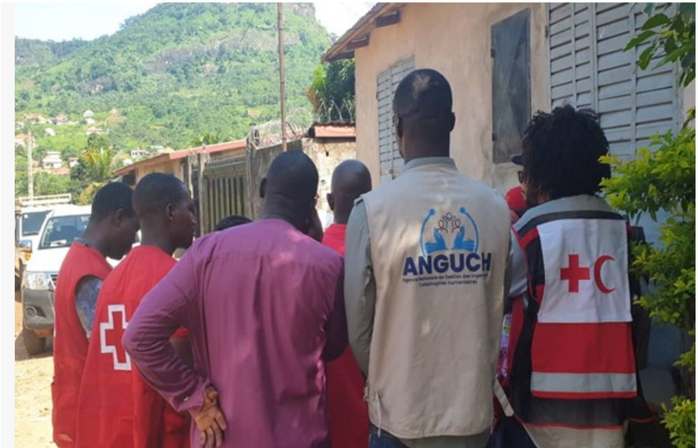
Field mission with IFRC, Guinea Red Cross, and Agence Nationale de Gestion des Urgences et Catastrophes Humanitaires (National Agency for Emergency and Humanitarian Disaster Management)