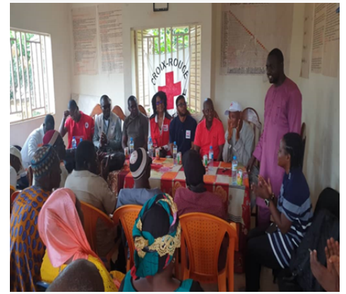
Meeting with Operations team in Coyah to guide response