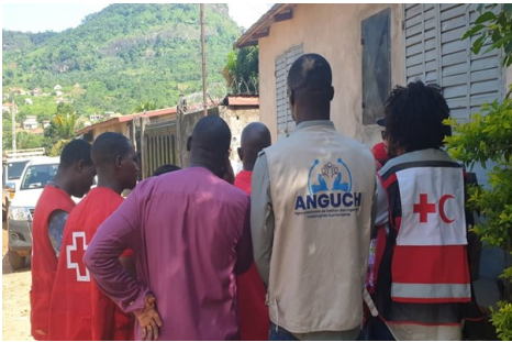
ANGUCH, FCCD, Local Authority and Volunteers assessing Coyah flood impacted areas.