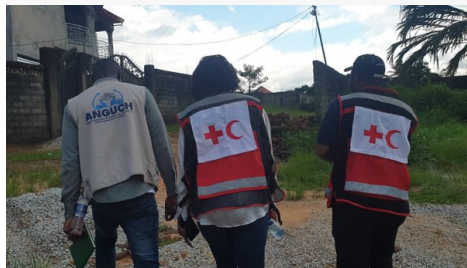
ANGUCH, FCCD, Local Authority and Volunteers assessing Coyah flood impacted areas