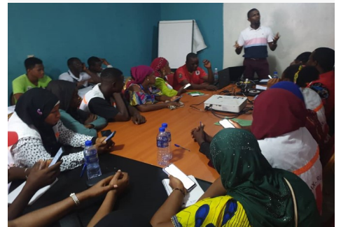
Training of volunteers on cash support