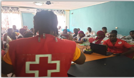
Training of Volunteers on CEA , PGI and PSEA approach