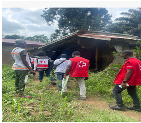
Site visit to affected communities by IFRC