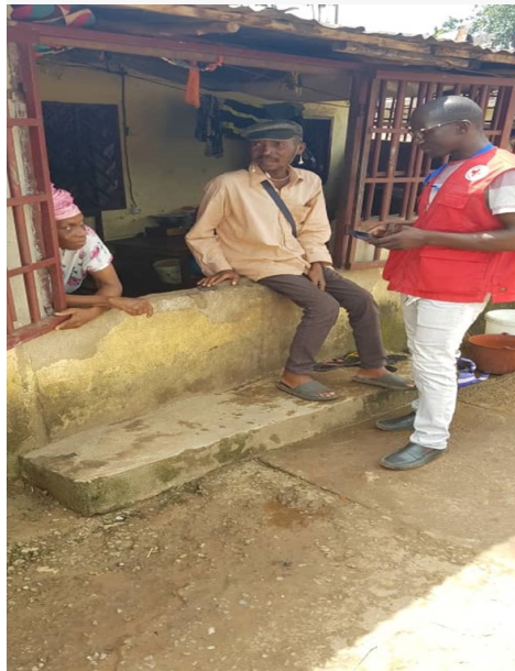
Volunteers registering beneficiaries using Kobo collect tool