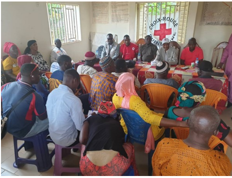
A dialogue session with community committee members attended by ANGUCH, local Authority, and beneficiaries...