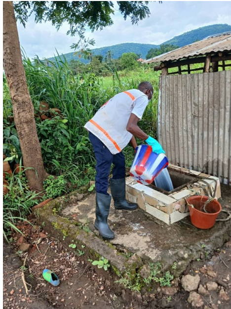
Volunteers support treatment of drinking water sources