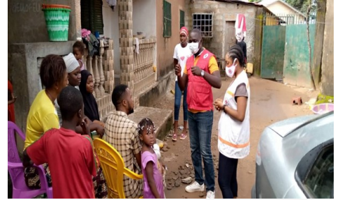
Volunteers engaged on sensitization on the storage of drinking water