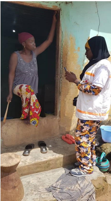
Volunteers registering beneficiaries using Kobo collect tool