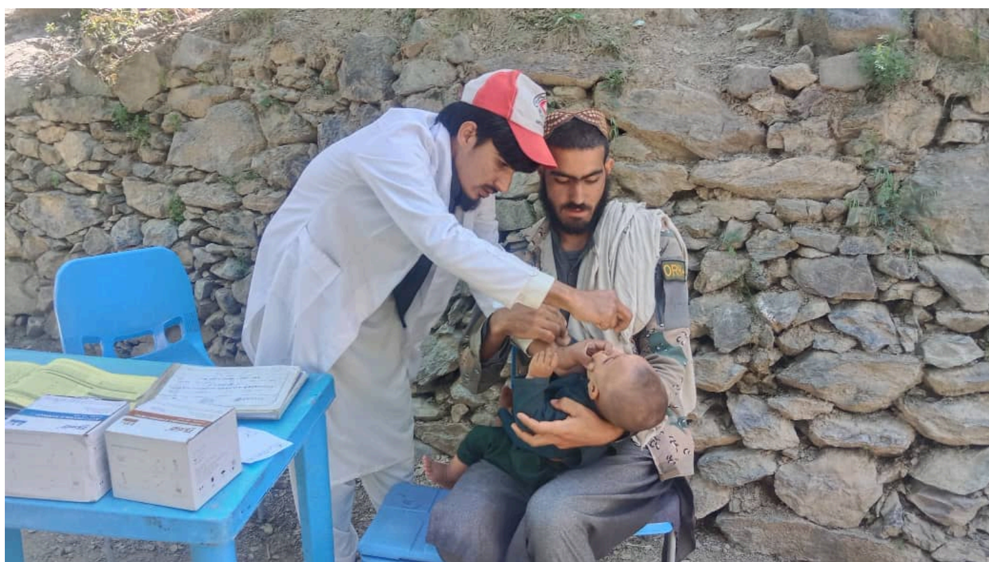
ARCS medical staff providing vaccination service.

The 'Operational Strategy' section of this report details the changes.