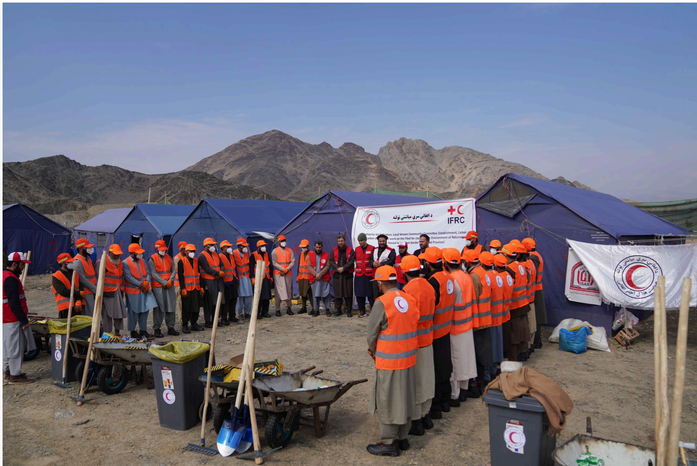
ARCS carrying out environmental sanitation activities.