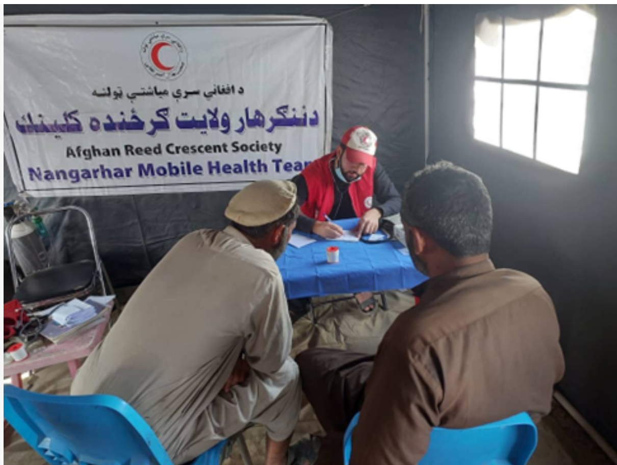
ARCS medical staff providing health service to Afghan returnees from Pakistan at Torkham border.