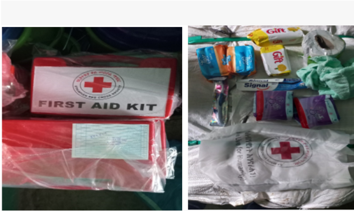
DIGNITY KITS AND FA KITS PROPOSITIONED

transport, and socio-economical services in some areas for the last 3 months making the situation complex and difficult to monitor. Due to the ongoing conflict, the region is facing accessibility challenges including transport, market, food insecurity, malnutrition, disease outbreaks, and lack of basic services. Following the initial scenario planning by ERCS (detailed in the imminent DREF rationale), the best case scenario was setting the peace dialogue to be successful by October which did not happen and from different sources unlikely to happen. The security situation is likely to remain volatile in the Amhara Region of Ethiopia due to ongoing military operations and failure of peace agreement. https://crisis24.garda.com . This requires another approach to tackle the critical emergency needs where access made it feasible.