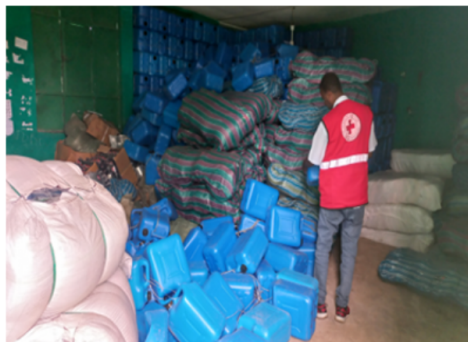
NFI prepositioned ERCS warehouse