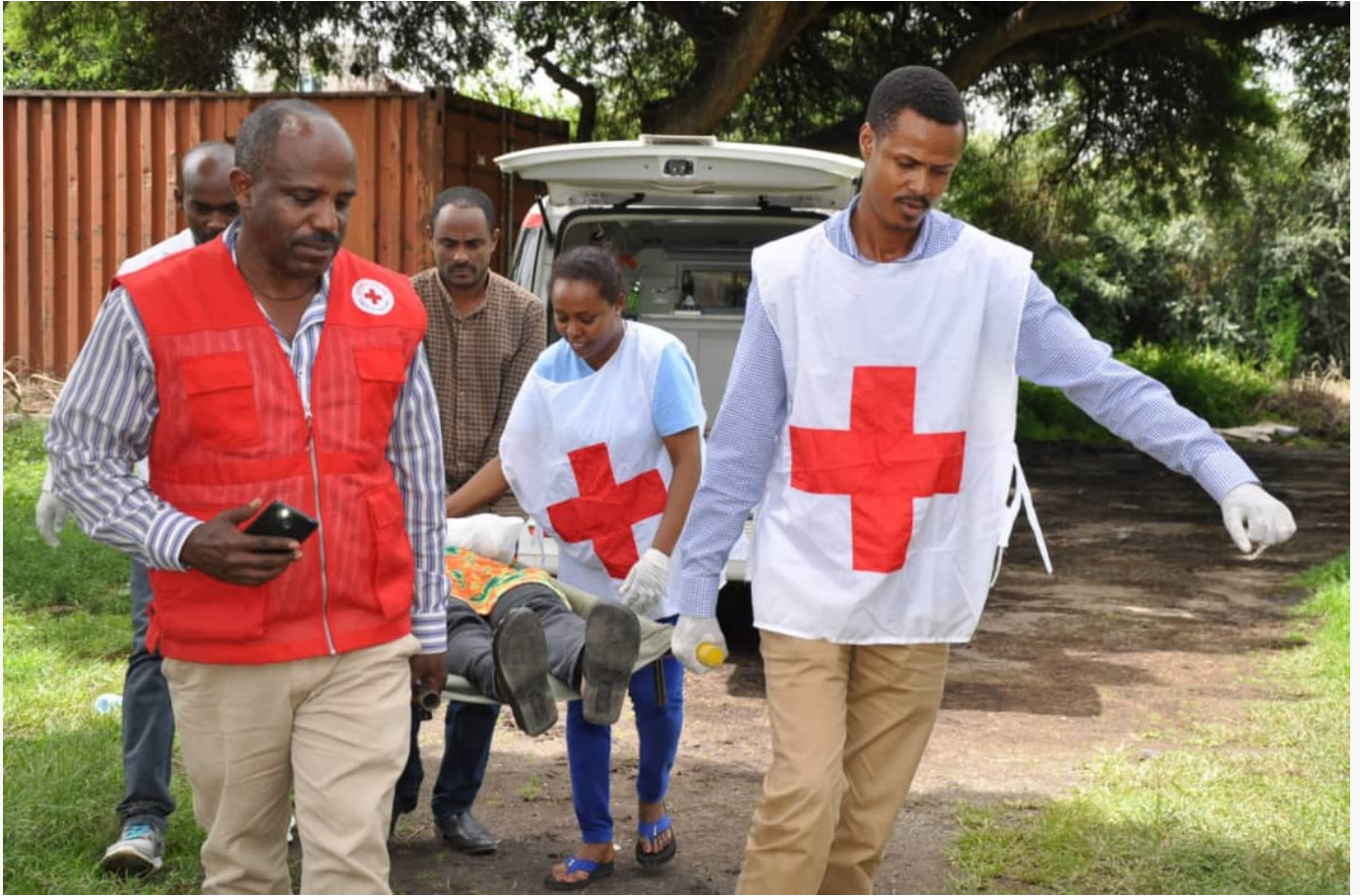
ERCS volunteers in action