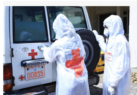
Training for Ambulance attendants