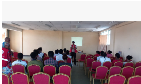
Volunteers training Bahirdar city