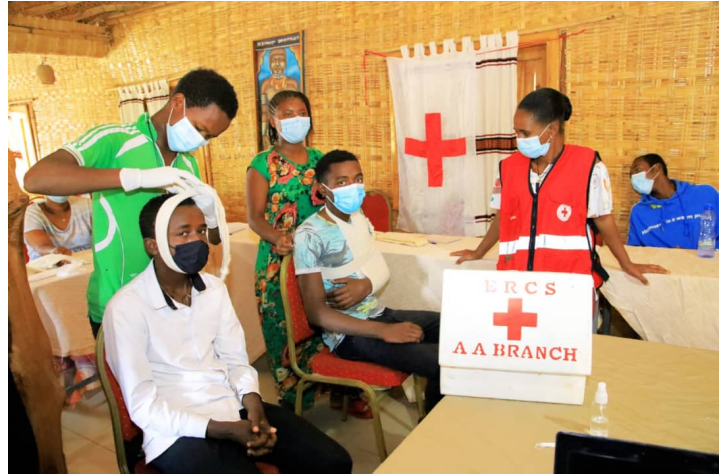
BFA training for volunteers