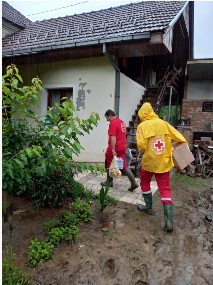
The staff and volunteers of the Red Cross of Jagodina provide support to the affected households.