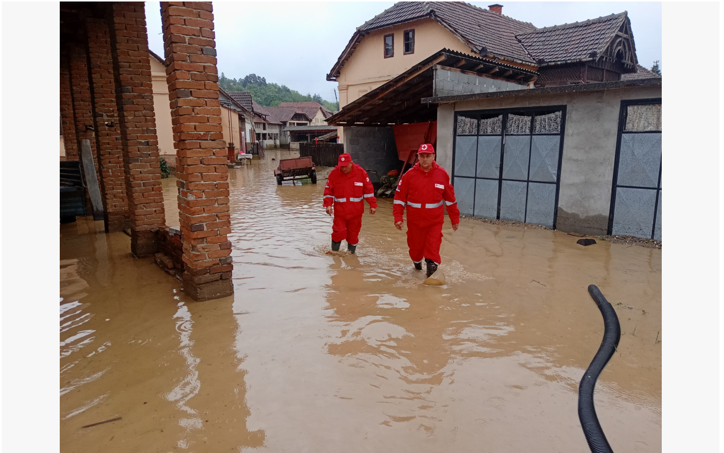
The Red Cross of Serbia (RCS) team responding to the floods in Svilajnac.