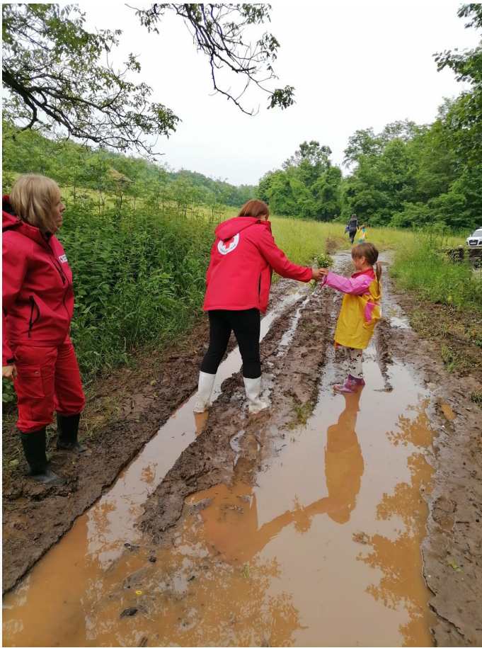
RSC providing support to affected households in Čačak.