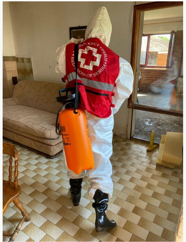
Disinfection of households in Prokuplje.