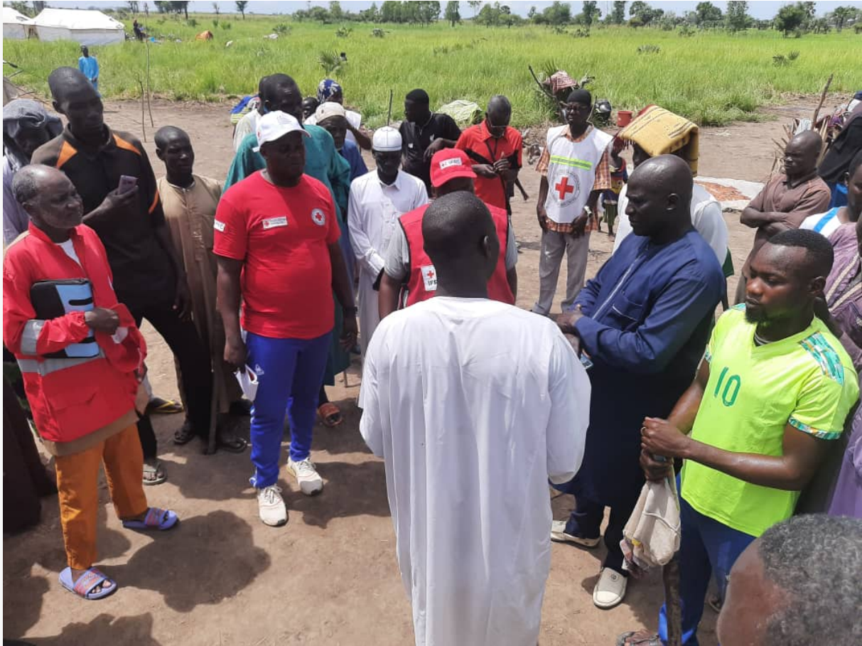
Volunteers during second assessment in Mourla Gobo et Mourla Gozom