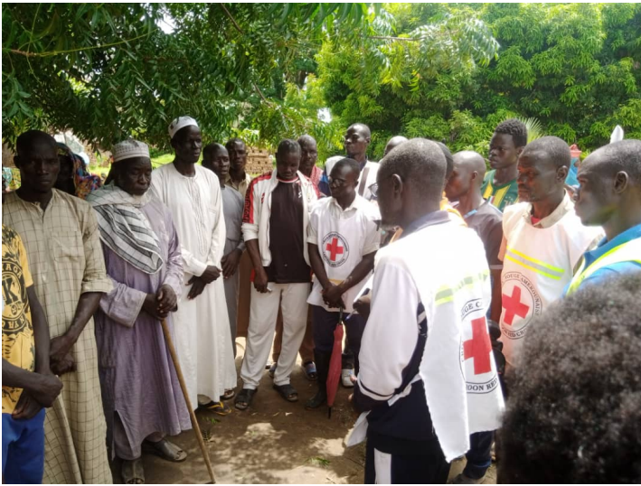
Volunteers discussing with community leaders