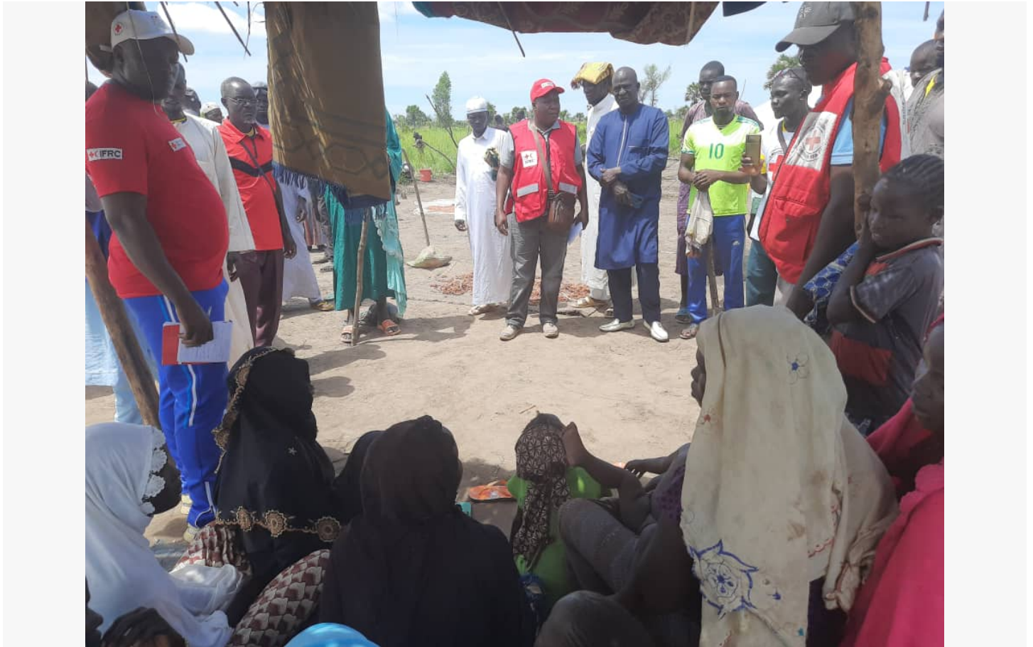
Field assessment by IFRC and CRC