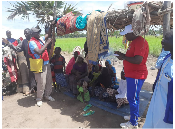
Volunteers discussing with Women group