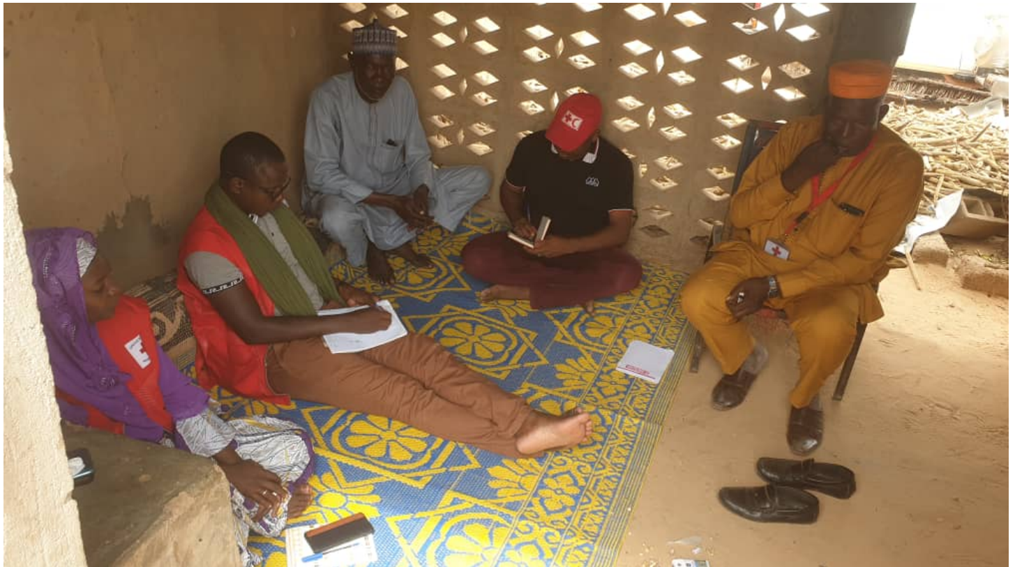
Outreach team interview with a village chief in Zinder