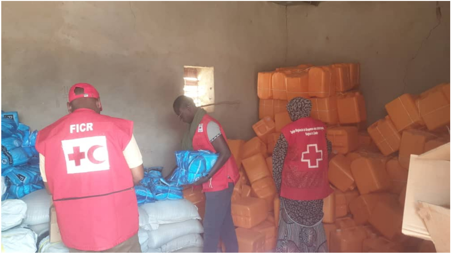
The Zinder Regional Committee and IFRC are carrying out a verification of the NFI stocks prepositioned in October 2023.