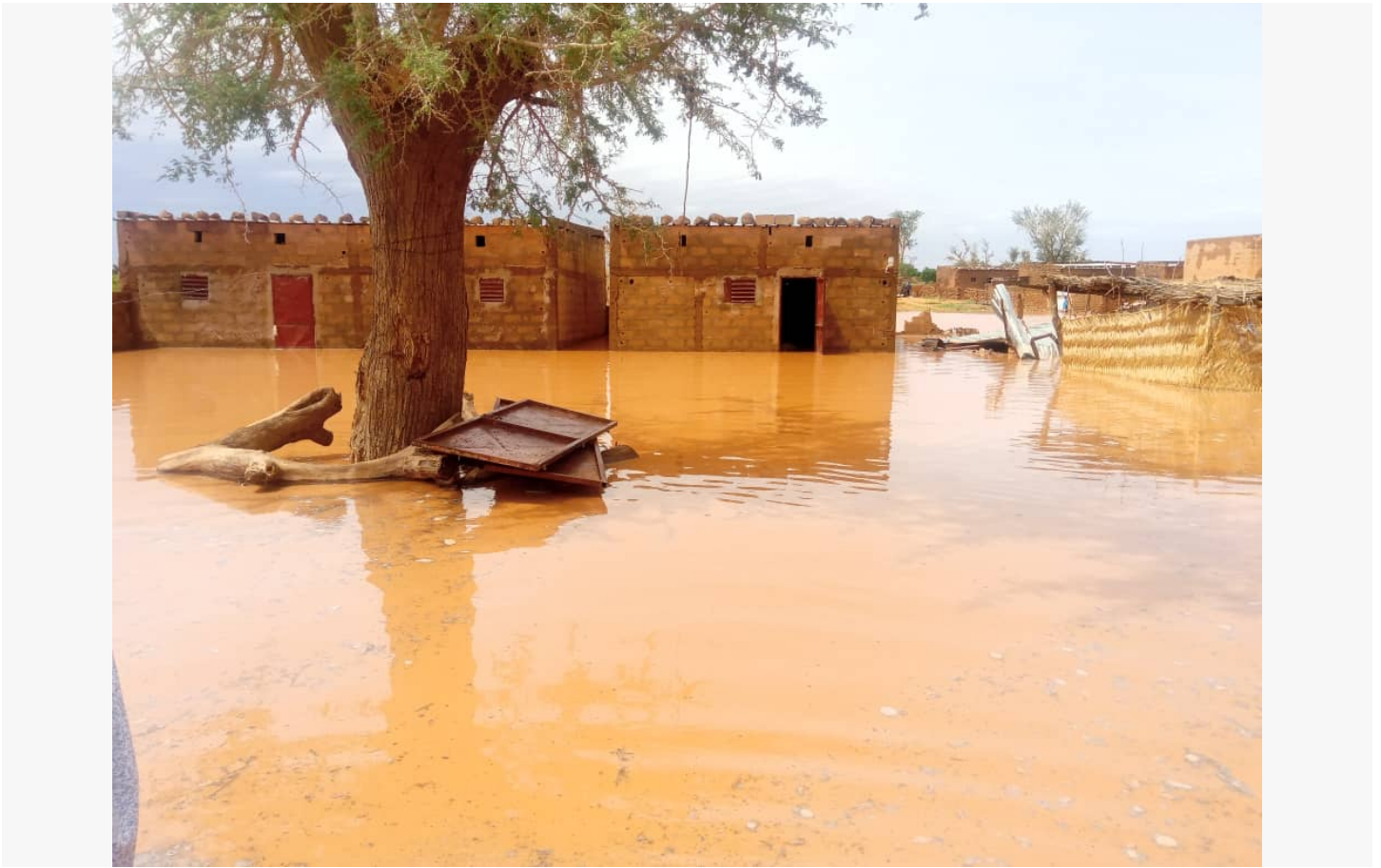
Damage caused by floods in Maradi region.