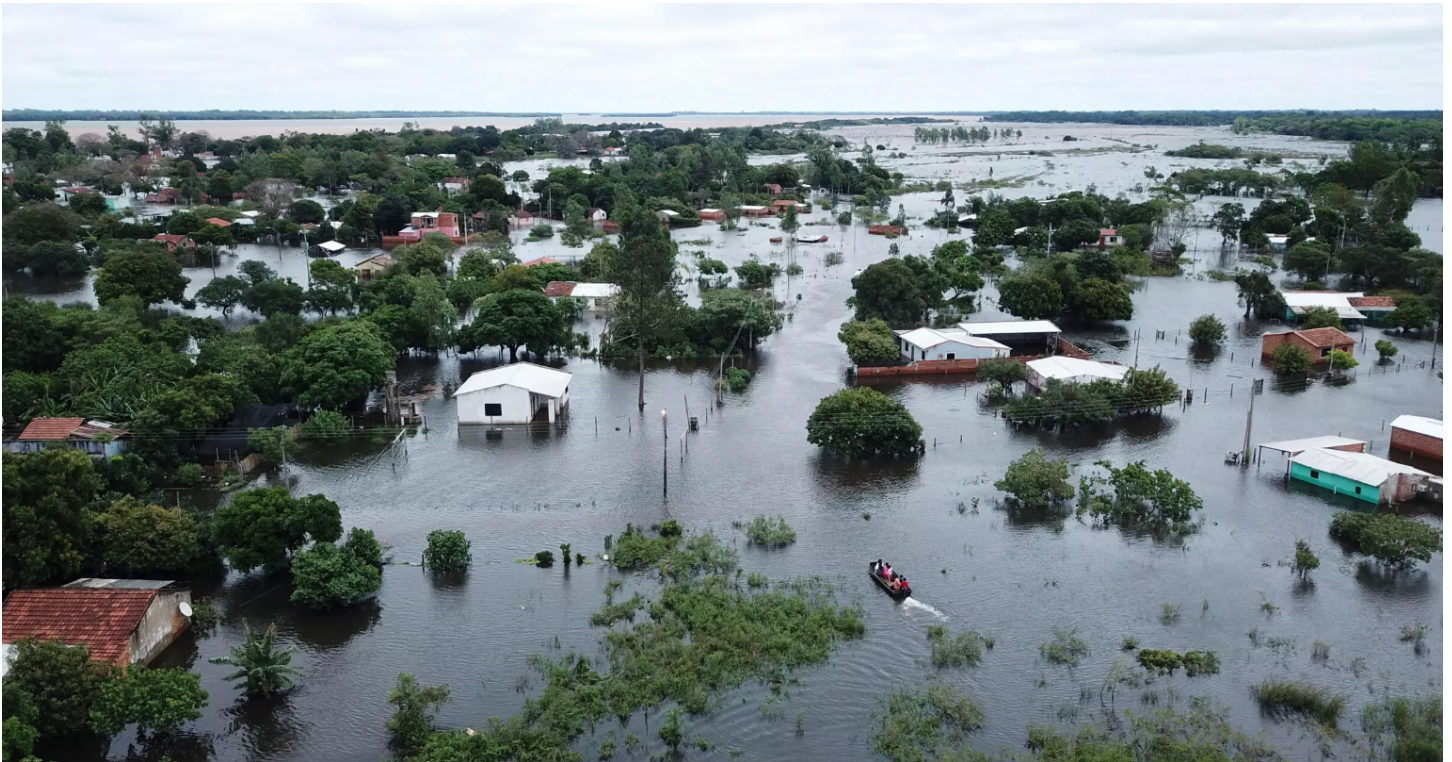
Aerial view of flooding in Ayolas, 300 km south of Asuncion, on November 3, 2023