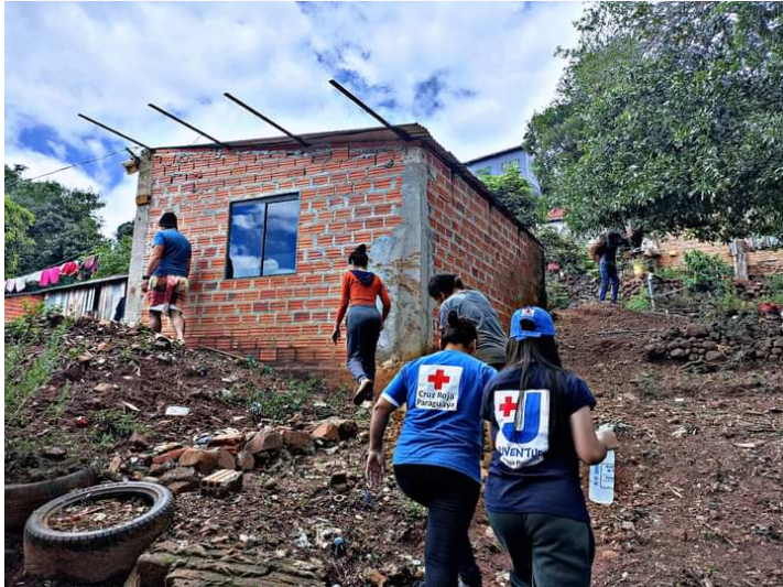
Rapid Assessments - Department of Alto Paraná - Source: Paraguayan Red Cross.

3. Departamento de Itapúa: https://drive.google.com/drive/folders/1u6tS7MxZkyMc1Oc3c1LO3ZGjSFNOEatz