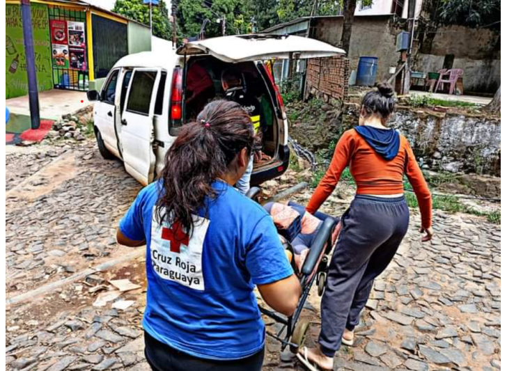
Evacuation assistance to families in Alto Paraná