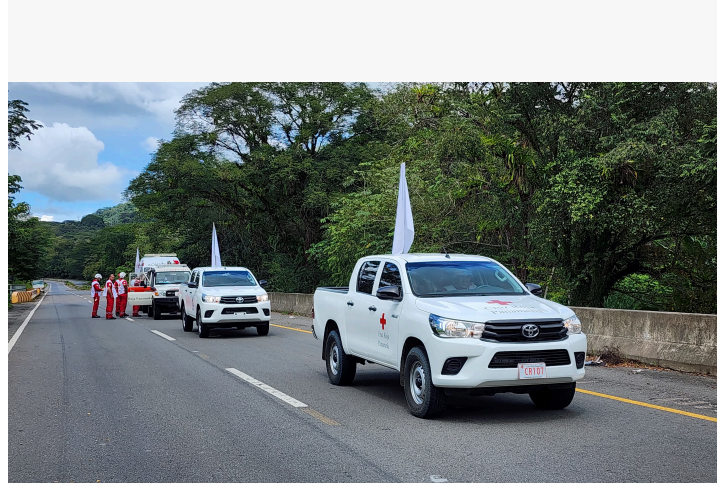
Red Cross National Society of Panama staff and volunteers on mediation tour. October 2023.