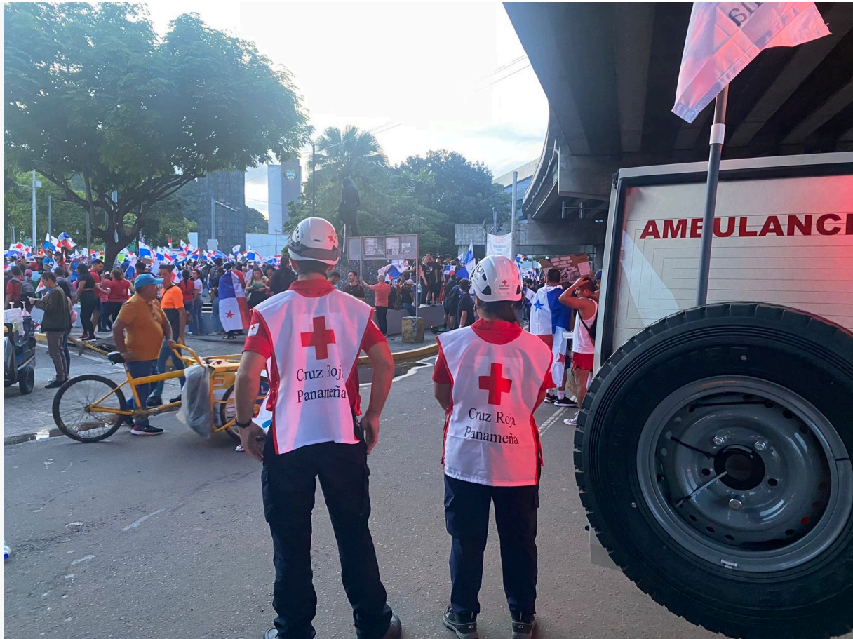
Volunteers of the Red Cross Society of Panama present at one of the demonstrations to provide pre-hospital care. November 2023.