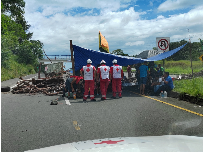
Red Cross National Society of Panama volunteers providing first aid on one of the blocked routes. November 2023.

On November 27, 2023, the Supreme Court of Justice issued a ruling on the unconstitutionality of Law 406 (4). The ruling was published in the Official Gazette, complying with the terms established by the National Constitution for the due confirmation of the Court's ruling.