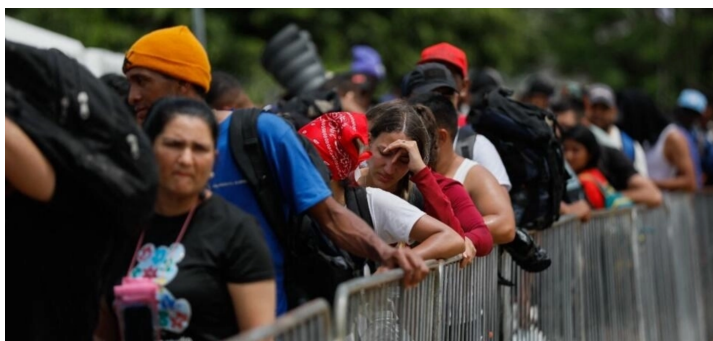
Photo 2. Migrants detained in Panama due to demonstrations and blockades in the country.