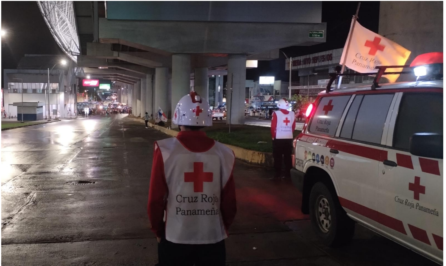
Red Cross Society of Panama volunteers providing prehospital care in different points of the country where large-scale demonstrations are carried out. 2 November, 2023.