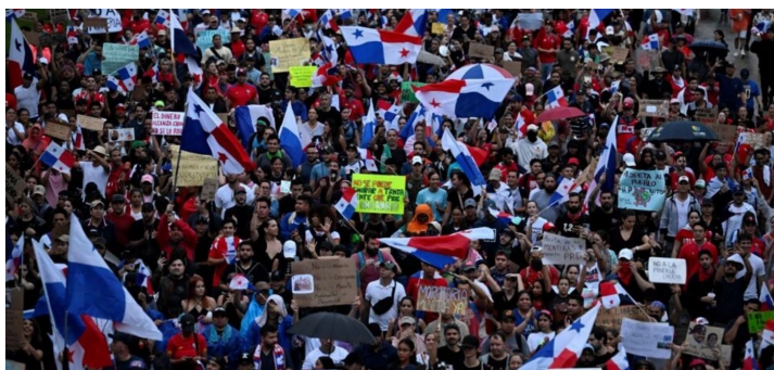
Photo 1. Demonstrations against the mining contract in Panama City, October 26, 2023.