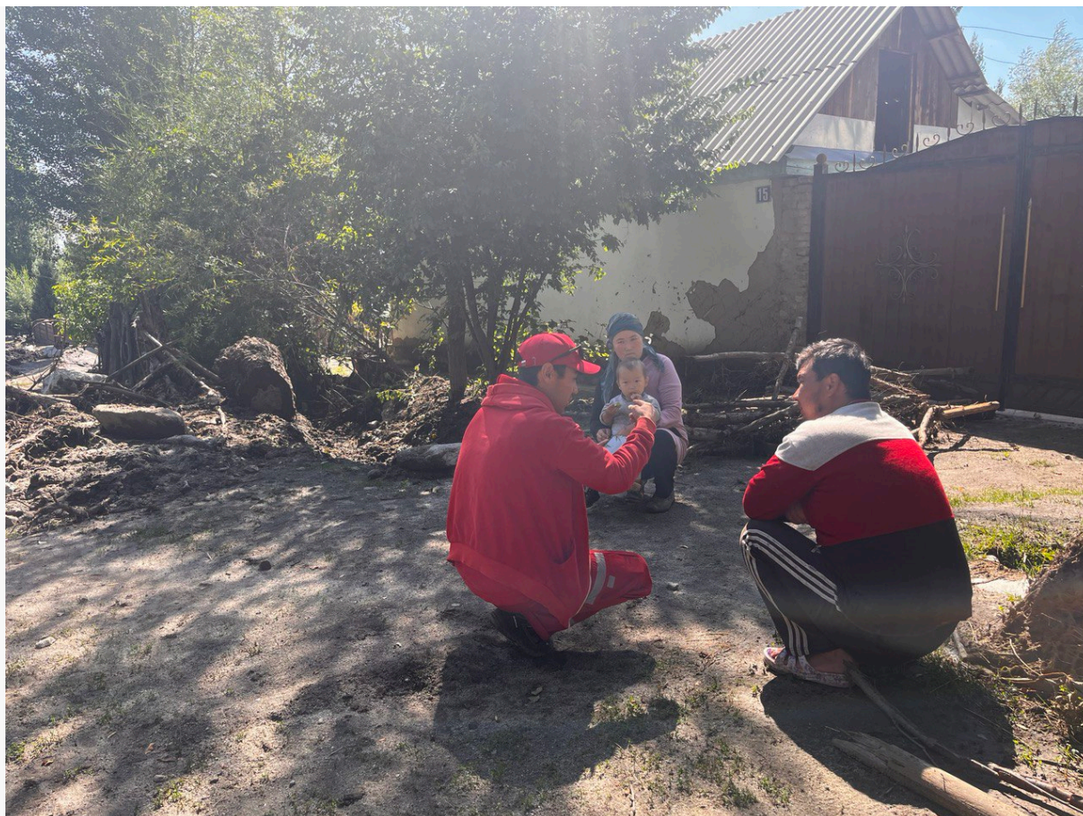
RCSK staff member assesses the needs of a flood-affected person.

main roads going to and out of villages, damaged residential and non-residential buildings, power outage due to poles being torn and electricity lines disrupted, and with cemeteries and animal burials flooded, there is increased likelihood of disease outbreaks