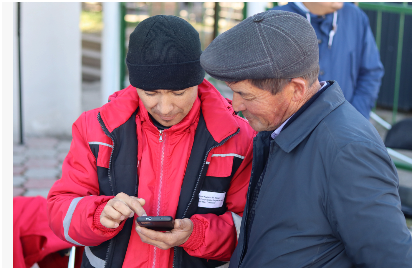
Red Crescent Society of Kyrgyzstan (RCSK) staff member conducts exit interviews during the distribution of cash.