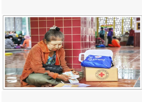
Photo 7: MPCA and NFI distribution in Bago Region, January 2024.