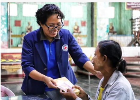
Photo 6: MRCS distributes MPCA in Hlegu Township, January 2024.