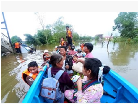
Photo 1: MRCS RCVs rescue residents in Bago Township.