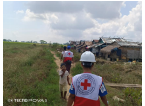
Photo 3: Rapid needs analysis and flood damage assessment in Bago, October 2024