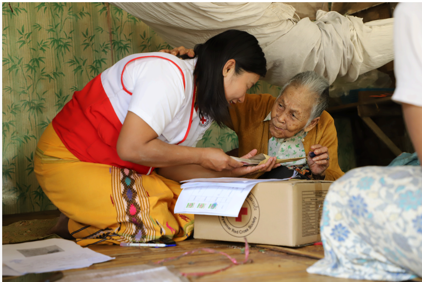
A Myanmar Red Cross volunteer distributes Multipurpose Cash Assistance and non-food items to an elderly community member in Bago Region.