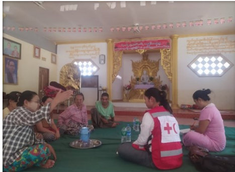
Photo 5: IFRC and MRCS conduct focus group discussions during post-distribution monitoring for MPCA in Bago, February 2024.