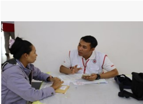
Photo 4: Exit survey during the cash intervention, January 2024.