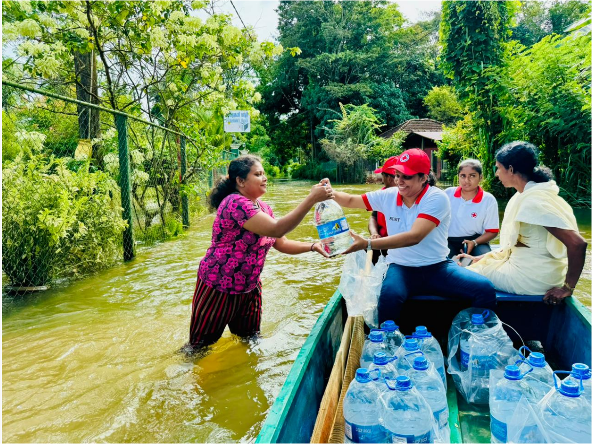
Volunteers from the SLRCS Galle branch distributing drinking water bottles to the affected families