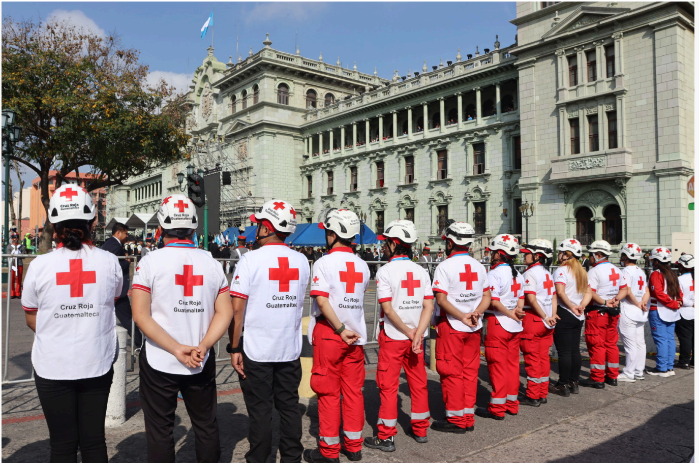
Volunteers from the Guatemalan Red Cross at Plaza de la Constitución, Zone 1, in Guatemala City. November 2023.