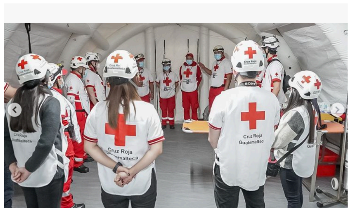
Guatemalan Red Cross volunteers at one of the aid stations set up in Guatemala City.