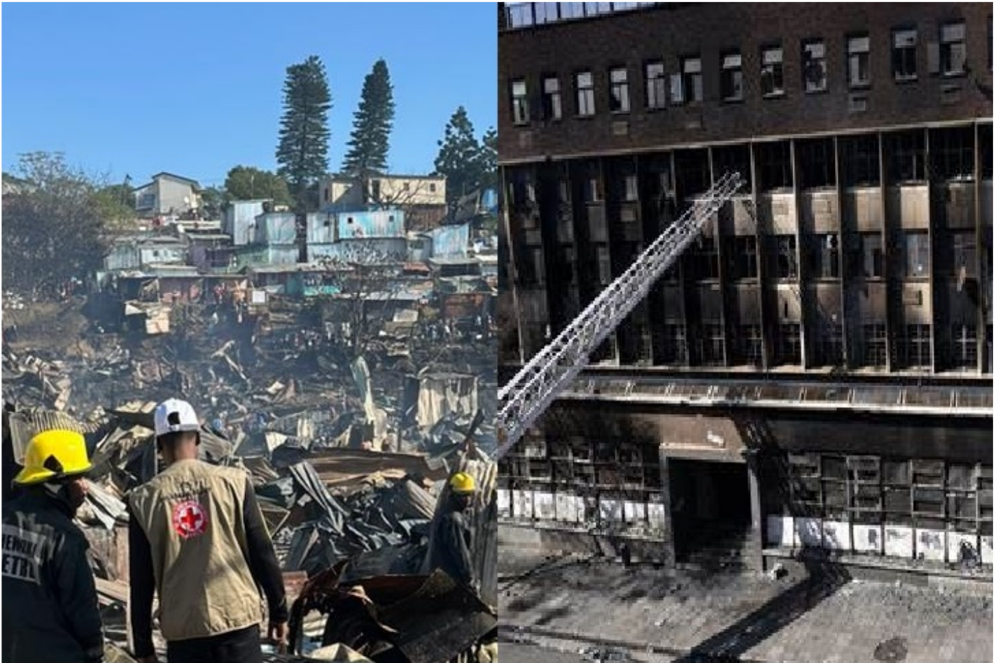
Johannesburg Fire 30.08.2023