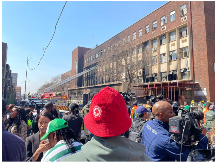
@SARCS on the ground for situation update on 31 August Johannesburg