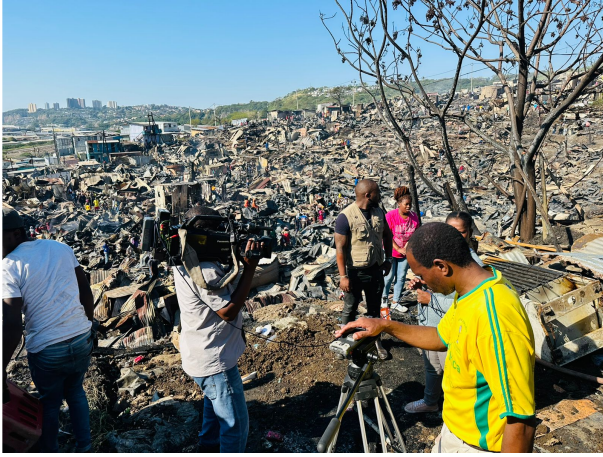
Devastation caused by the fires

https://www-iol-co-za.webpkgcache.com/doc/-/s/www.iol.co.za/news/politics/joburg-fire-ramaphosa-wants-laws-reviewed-to-fast-track-development-e479d19a-d18e-4e0c-800c-becd33ac2b3a