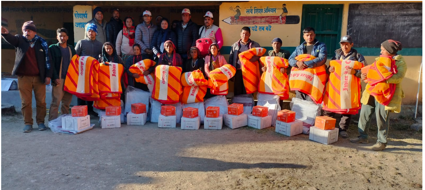
Targeted households receiving relief items from the Indian Red Cross Society in Uttarakhand